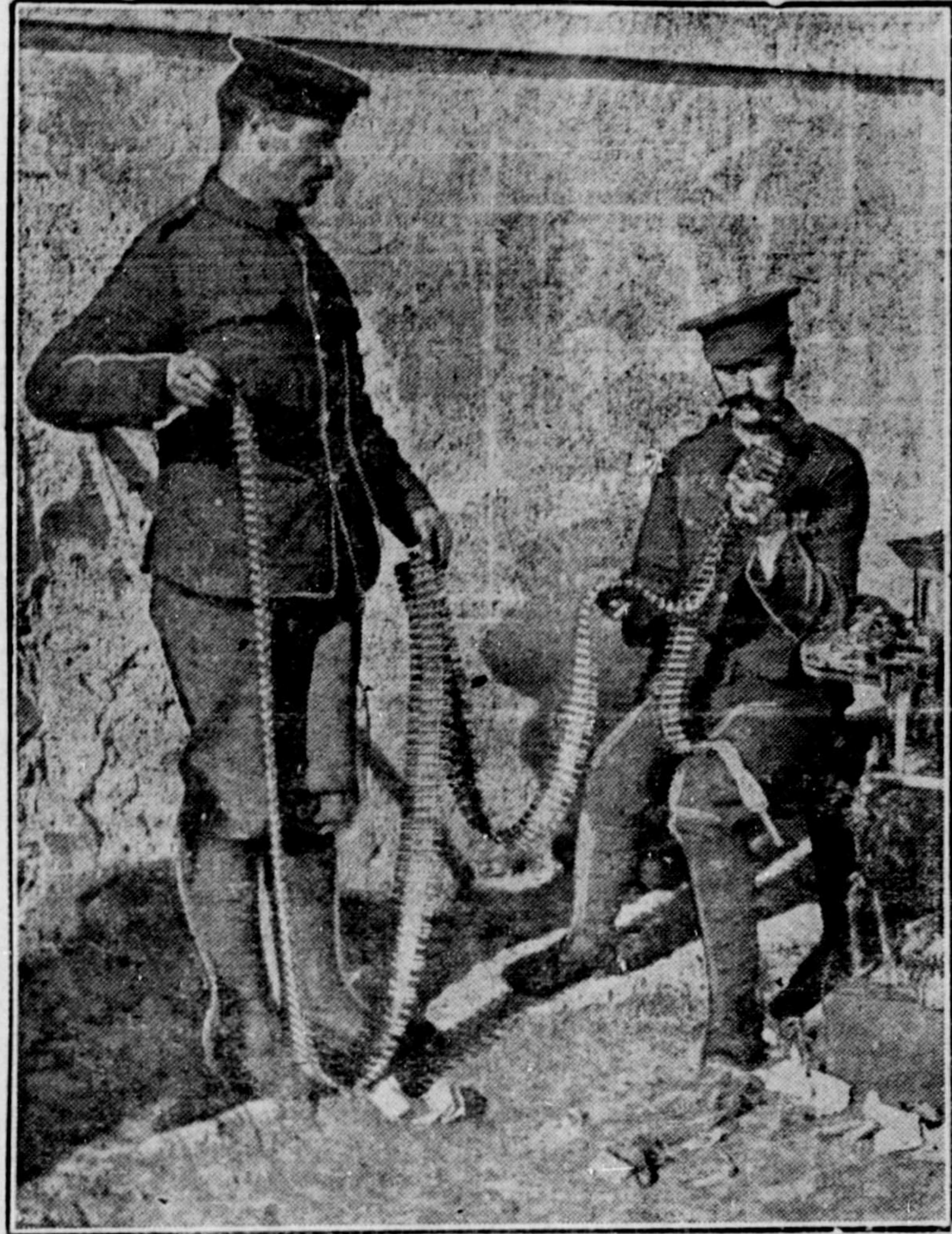
FILLING THE "DINNER PAIL" OF A MACHINE GUN

What might have been a very serious fire broke out in the upper storey of the Royal Hotel on Thursday afternoon. The brigade was quickly on the scene and the blaze was put out in a very few minutes. The damage was slight.