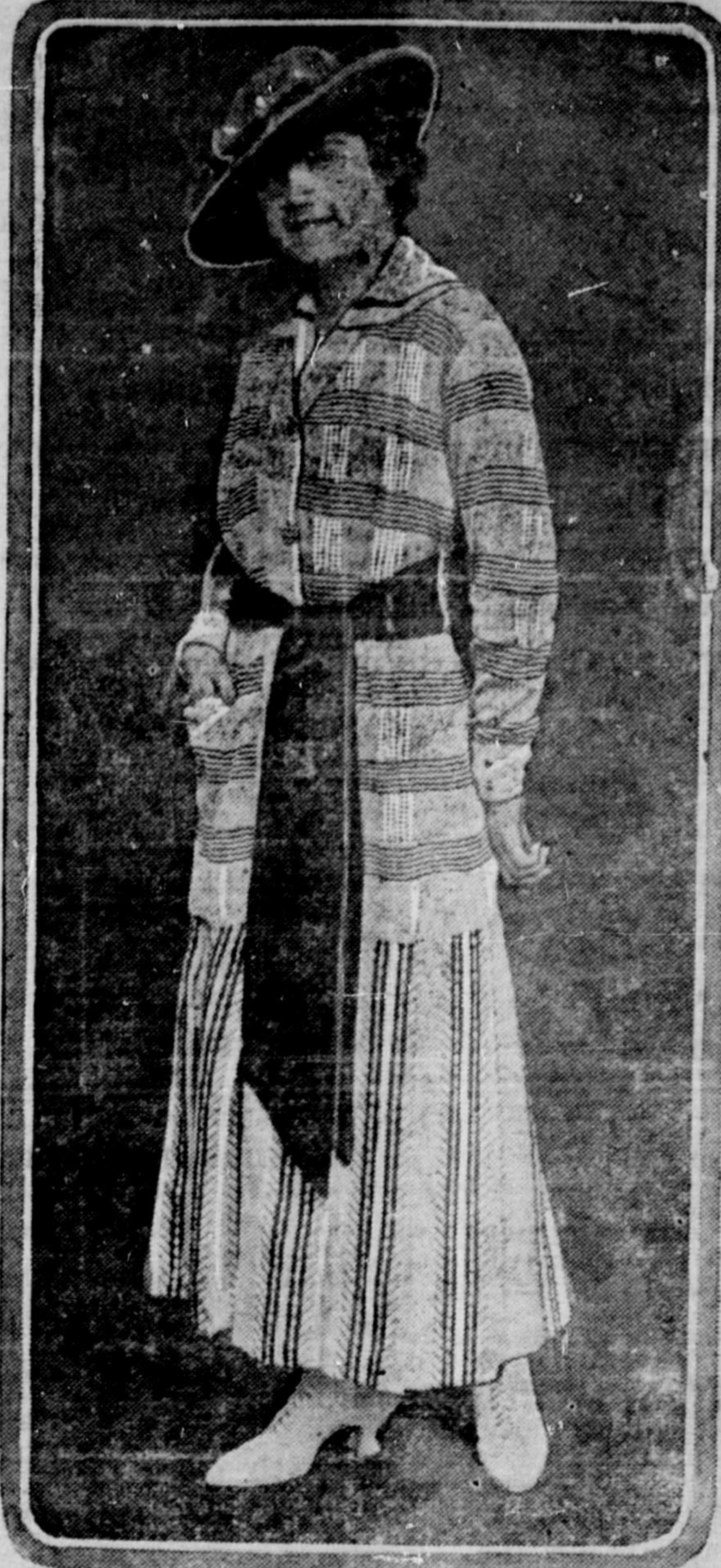
STRIPES BOTH WAYS.—Plaid silk sweater worn with a sport skirt of pussy willow silk.

The Daily News some time ago reported that kelp was to be harvested on the southern part of this coast and a reduction plant is now an accomplished fact and a Los Angeles boat builder has built a kelp harvester for the company. The harvester is 159 feet over all, with a width of 40 feet. It is self-propelling, being equipped with twin screw propellers driven by two 110 h. p. Union engines. It will have a daily cutting capacity of 500 tons.