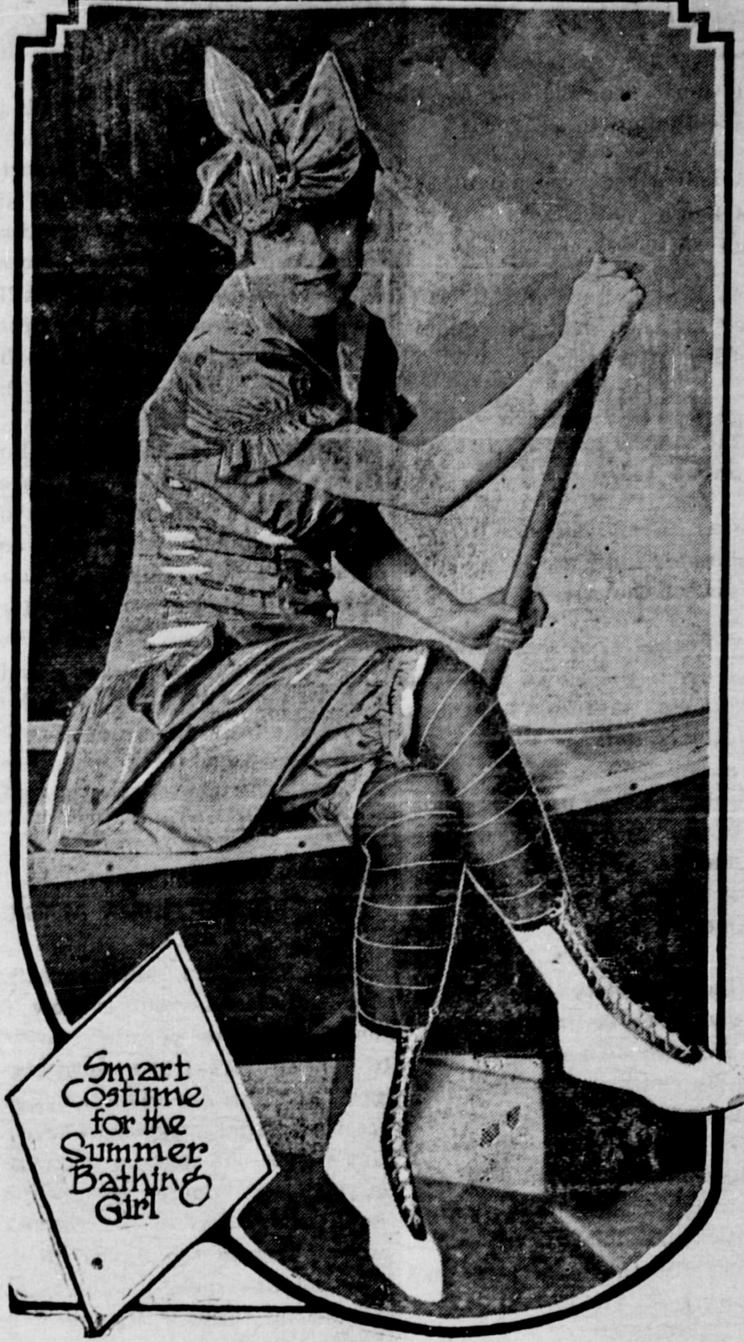
Smart Costume for the Summer Bathing Girl

J. L. MATHIEU CO., Prop. Sherbrooke, P.Q. For bottles and Mathieu's Formulae—these are useful also in clearing the throat and purifying the atmosphere. See a list of products. 4-173