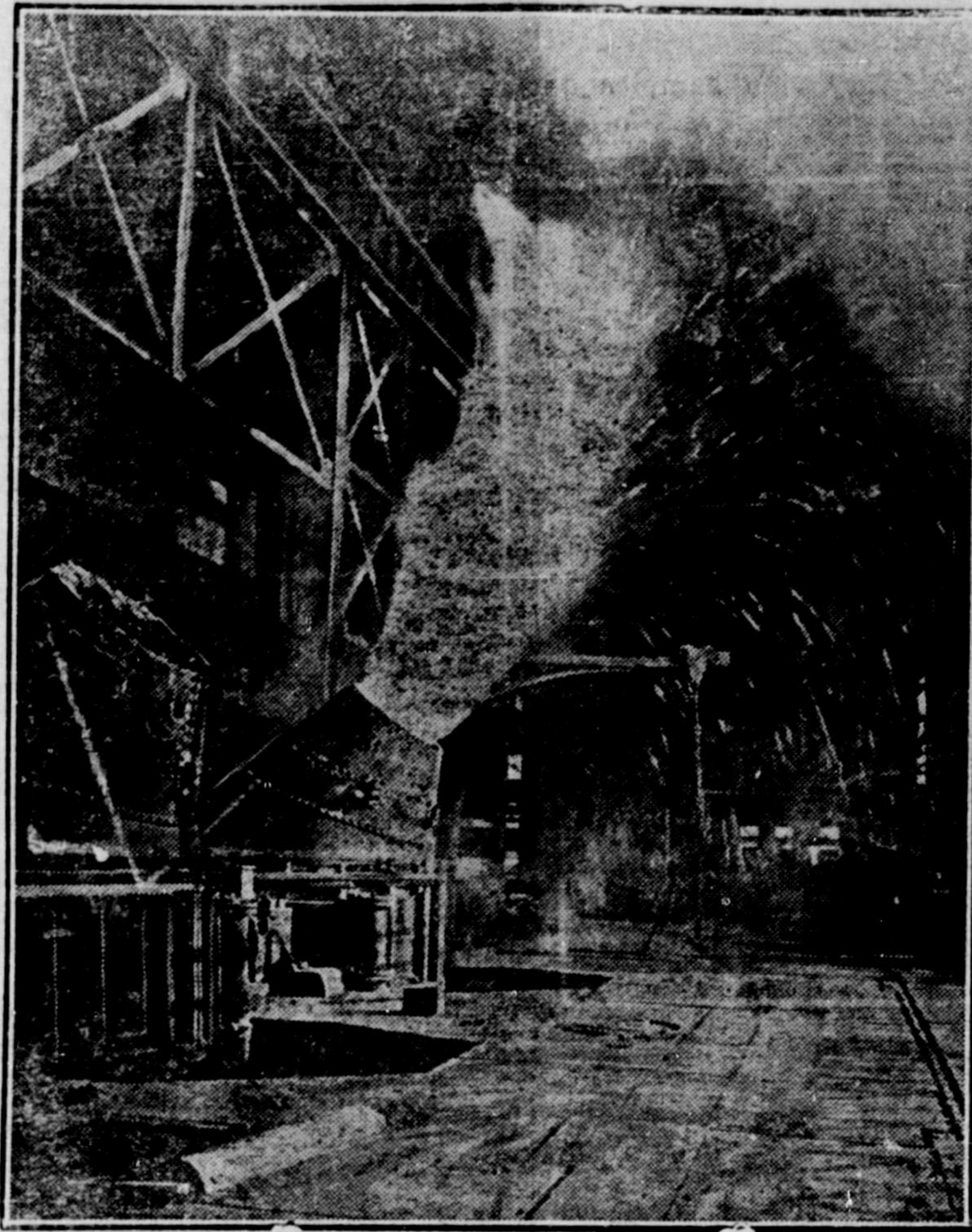
BESSEMER FURNACE PREPARING STEEL