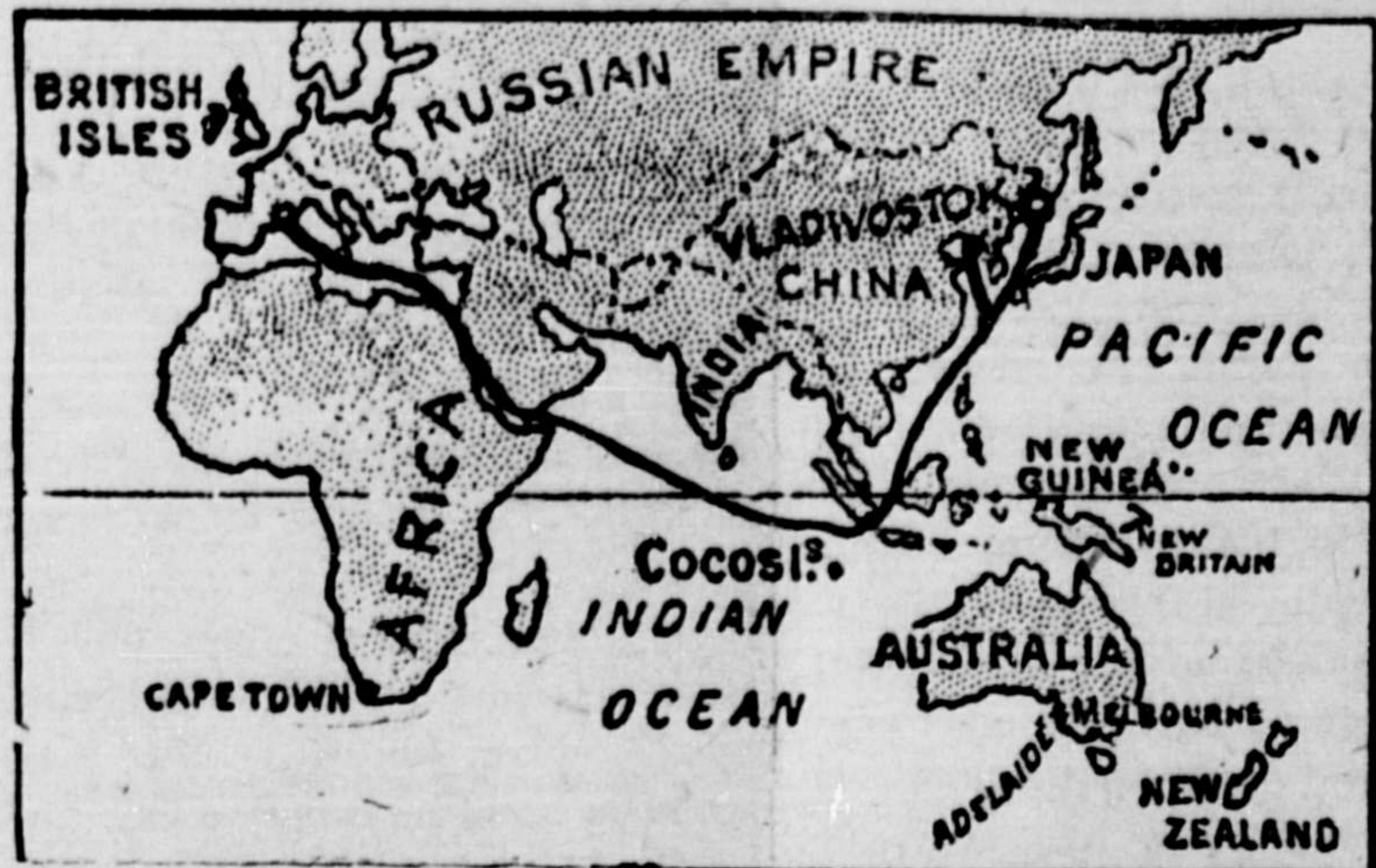
RUSSIAN TROOPS LAND IN FRANCE The accompanying map shows the probable route taken by the Russians who have been landing in France to fight beside their French allies on the western front.

NOTICE Owing to a large number of requests the management of the Westholme Theatre announce that they will show "My Old Dutch" after "Still Waters" in the second show only FRIDAY NIGHT.