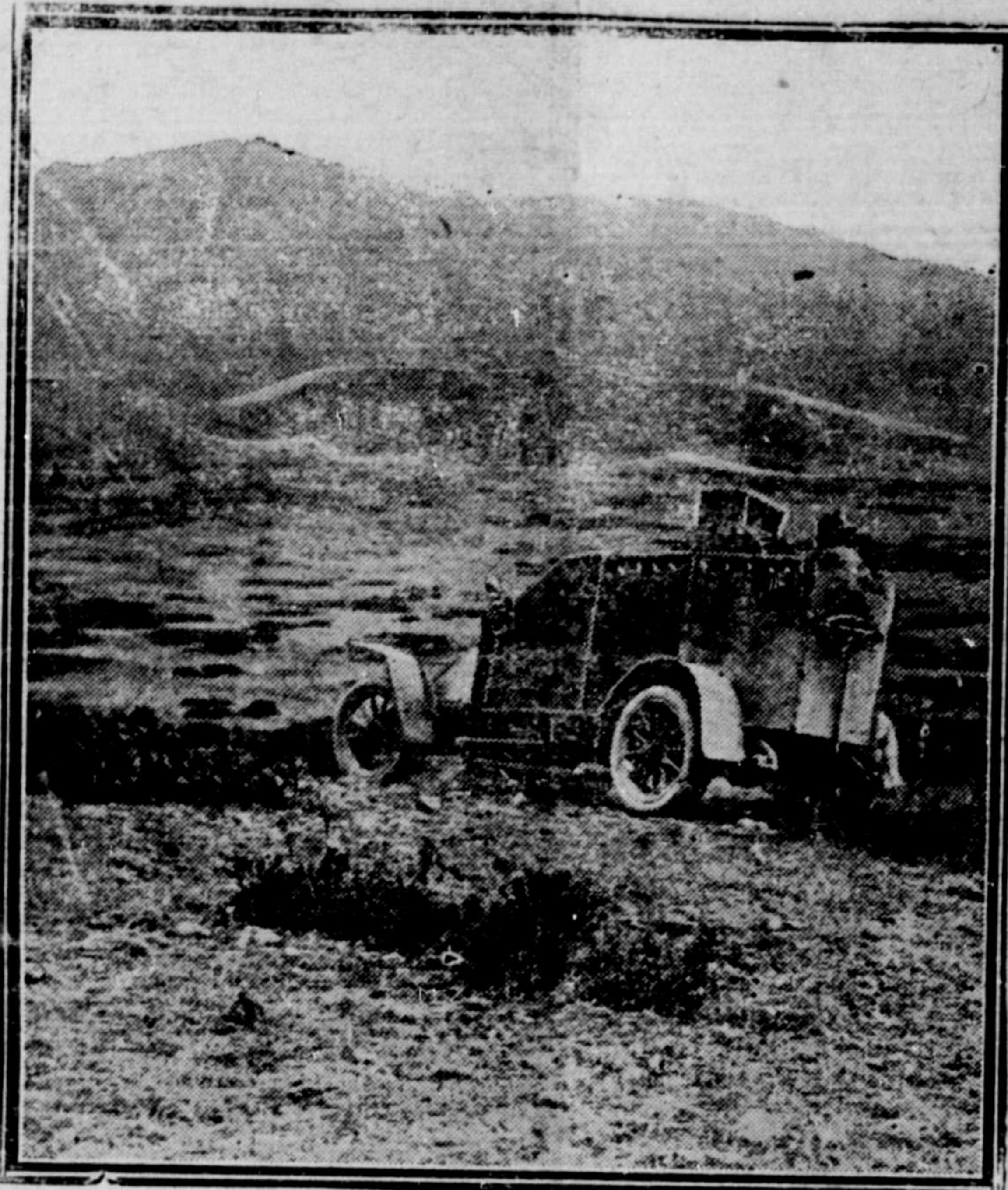
ARMORED MOTOR CAR IN ROUGH ACTION

Good potatoes on sale at $1.40 per sack. Fuller & McMeekin.