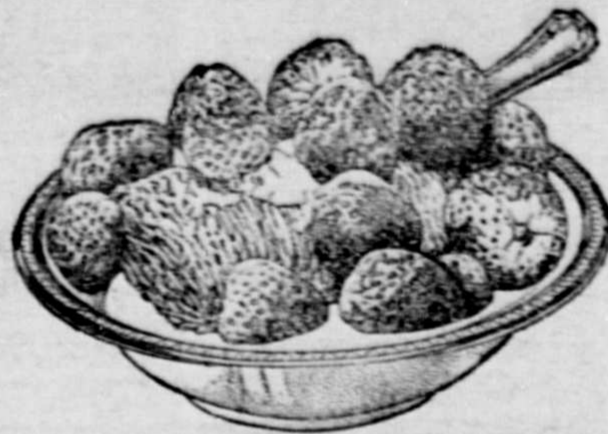
Made in Canada.

You Owe Yourself this Rare Treat after the heavy meats and the canned vegetables of the Winter—with a jaded stomach and rebellious liver— Shredded Wheat with Strawberries —a dish that is deliciously nourishing and satisfying—a perfect meal, and so easily and quickly prepared. For breakfast, for luncheon or any meal.