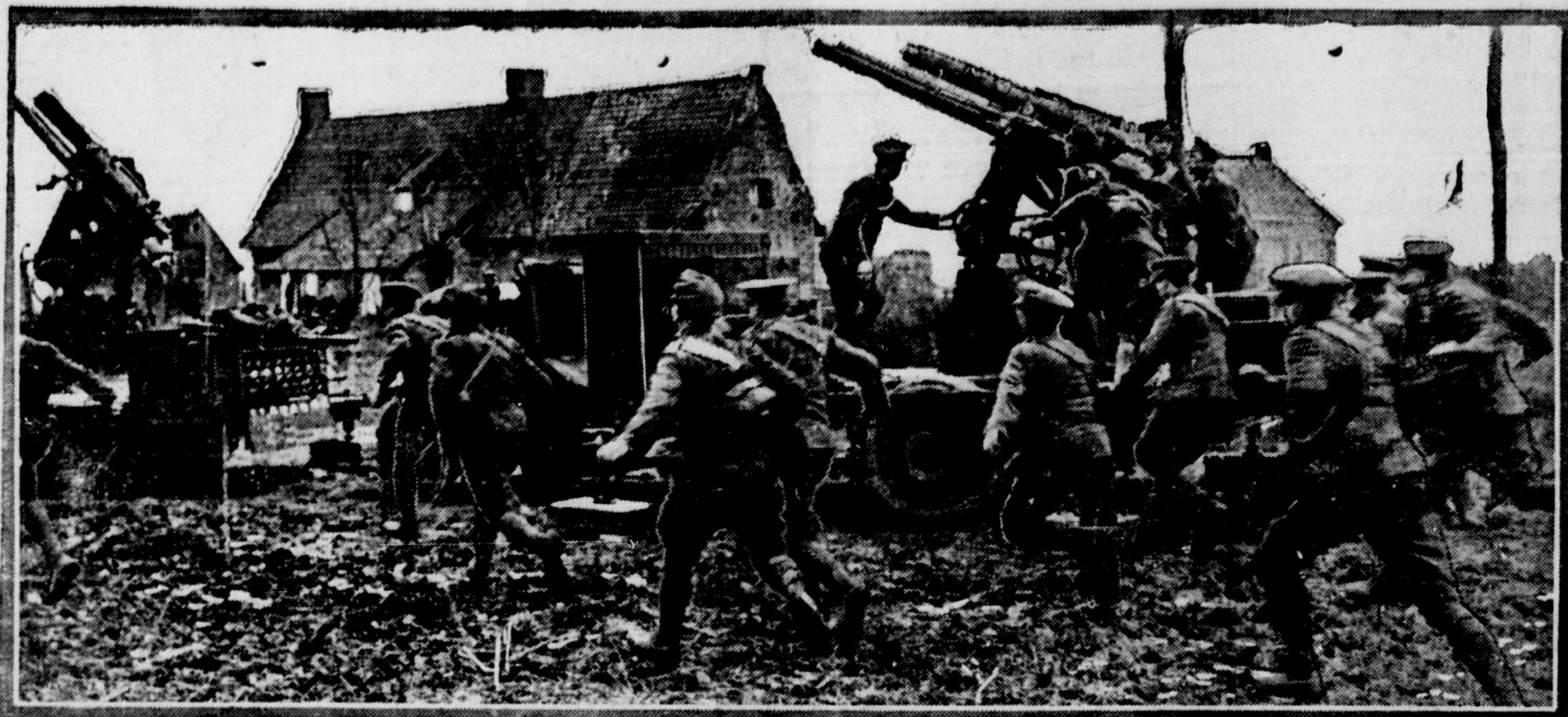
WHEN A GERMAN "FOKKER" COMES WITHIN RANGE OF BRITISH ANTI-AIRCRAFT GUNS.—A very exciting game is the winging of the enemy's aircraft. The warning "Here comes a Fokker" sends every man to the guns and great is the joy when a machine is winged. Photo shows men rushing to the guns.

GO TO LONDON CAFE FOR THE BEST MEALS STRICTLY UNION HOUSE Hart Bk. Third Ave. BOXES FOR LADIES