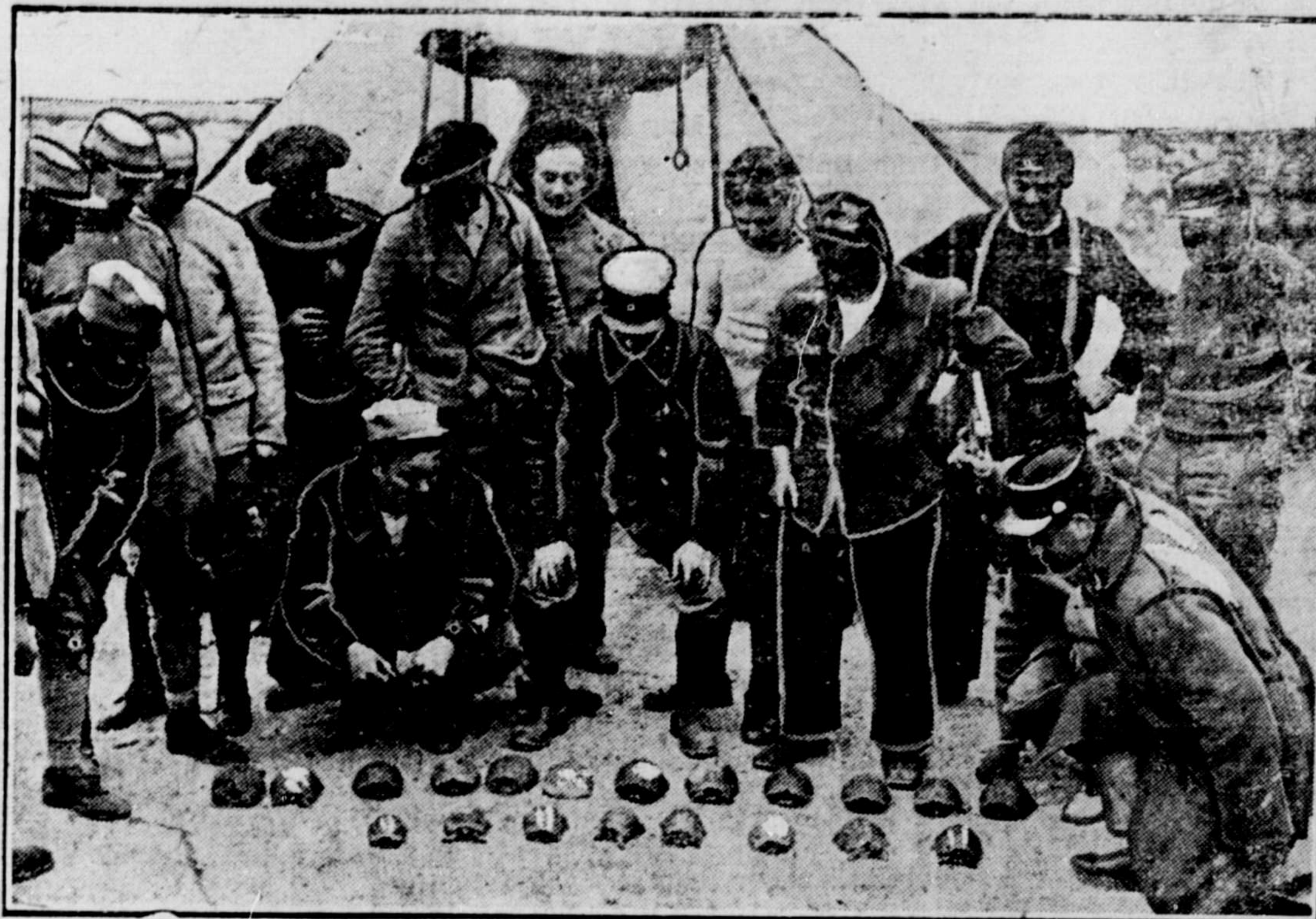
French soldiers in their leisure hours indulge in many queer sports. In this picture a group of French aviators at Saloniki are seen amusing themselves in organising turtle races. The start is signalled in the orthodox manner, by firing of a pistol.