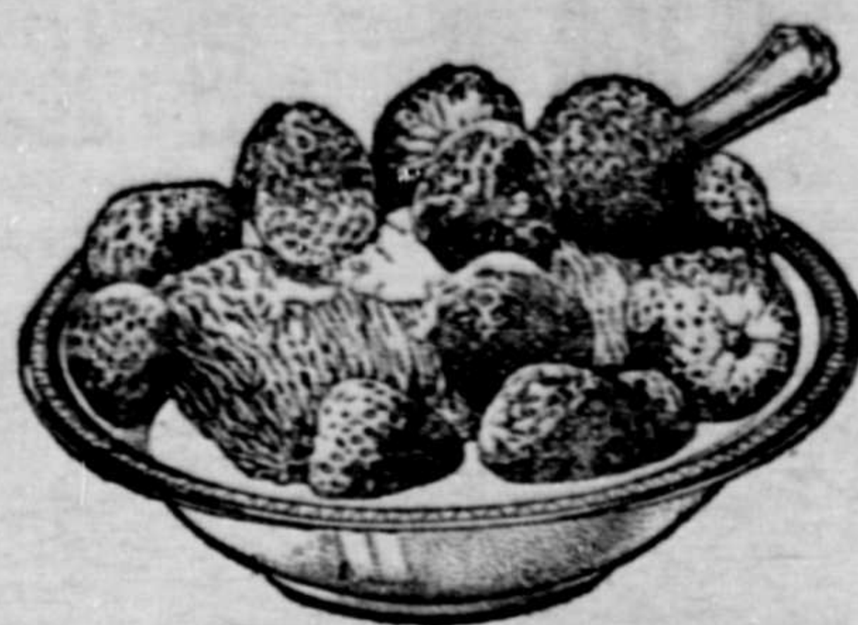
Made in Canada.

No Palate-Joy Like This —The richest man in the world could not buy anything more pleasing to the palate or more strengthening than Shredded Wheat Biscuit with Strawberries and cream . A simple, natural diet that will bring health and strength for the Spring days. Try it for breakfast; eat it for luncheon.