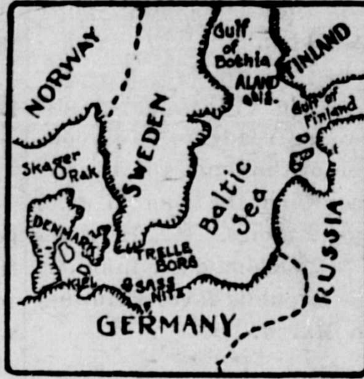
THE NAVAL FIGHT

The top picture is that of the German battleship Pommern which was sunk by British torpedo boats in their daring rush amongst the Kaiser's fleet in the gathering darkness on May 31st off the Skagerrack. The smaller picture is that of the German cruiser Frauenlob, which is officially admitted by Berlin to be missing since the historic naval battle. The little inset map shows the Skagerrack, where the fighting took place.