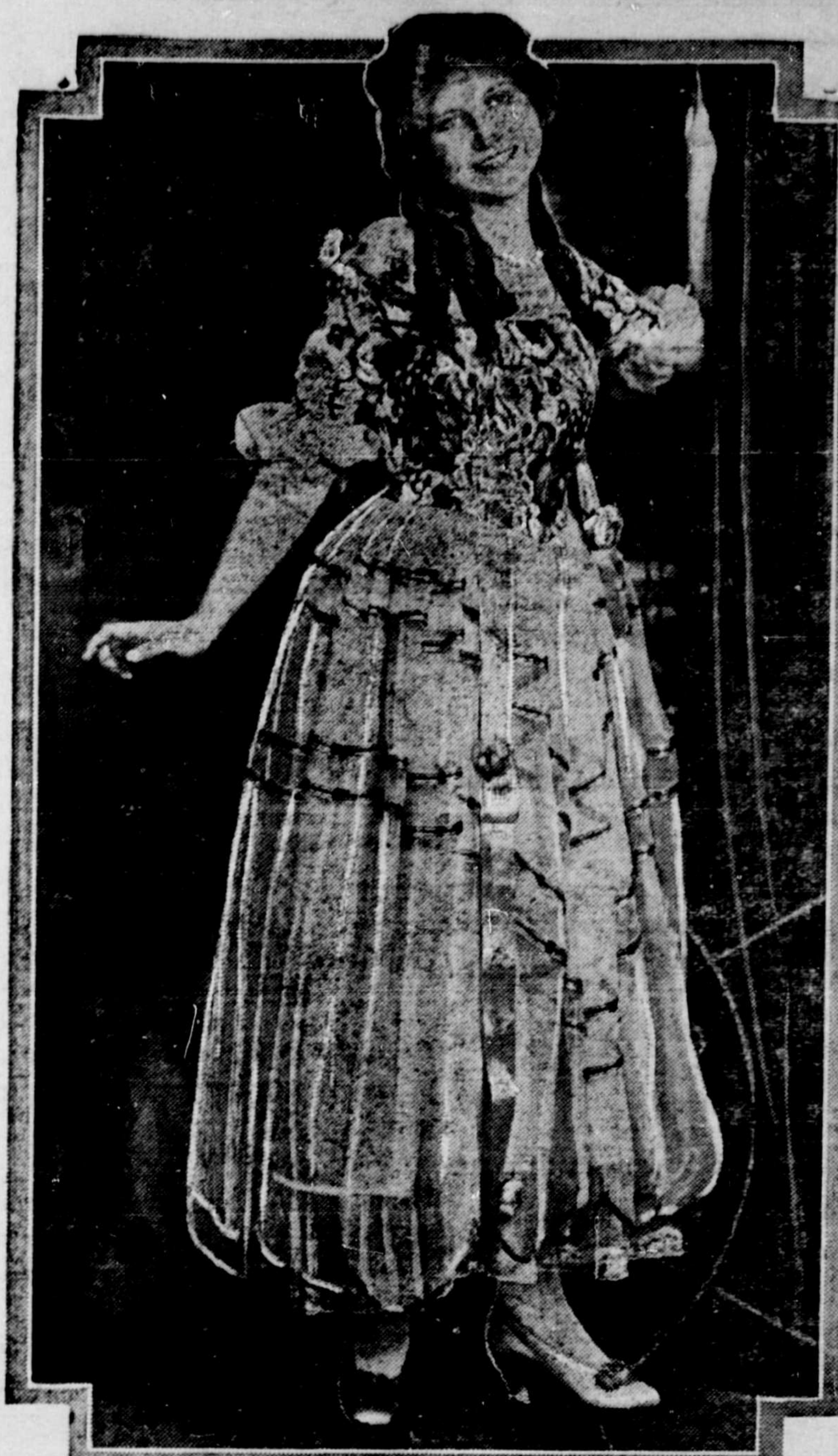
CHARMING EVENING GOWN—This elaborate frock for evening wear is modelled especially for the budding debutante. The gown has a bodice of heavy taffeta in rich tones of red, purple and yellow, which create a mingling of color pleasing to the eye. The skirt is supported by hoops and silver bands on the shoulders give a dainty finish.