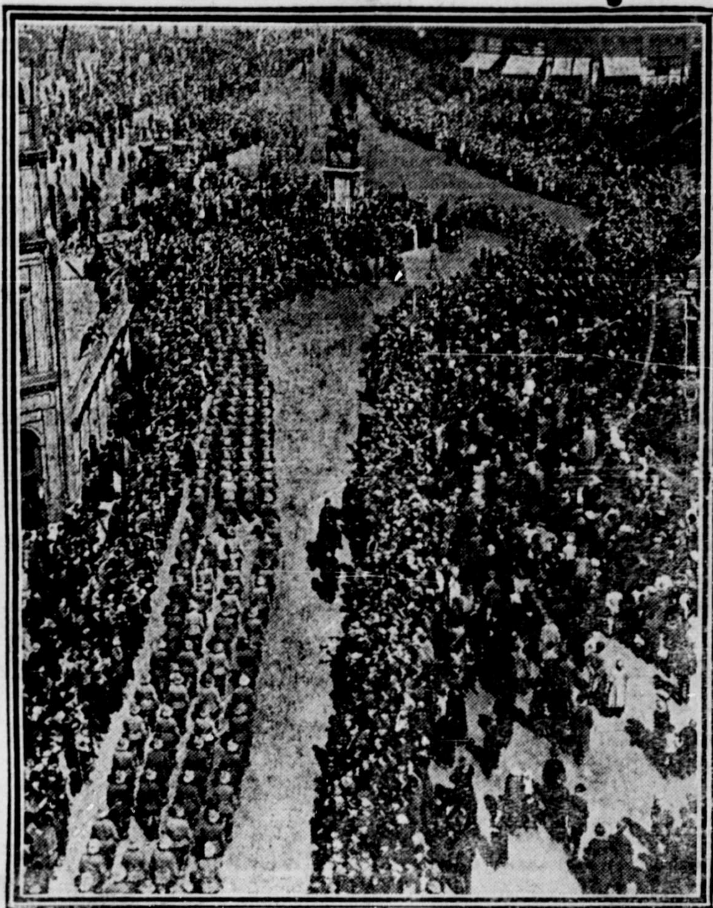
Tens of Thousands of Australian Troops March Through London en Route to the Front.—All London turned out to greet the tens of thousands of Australians fully equipped and prepared for transit to the firing line as they marched through the streets of the British capital.