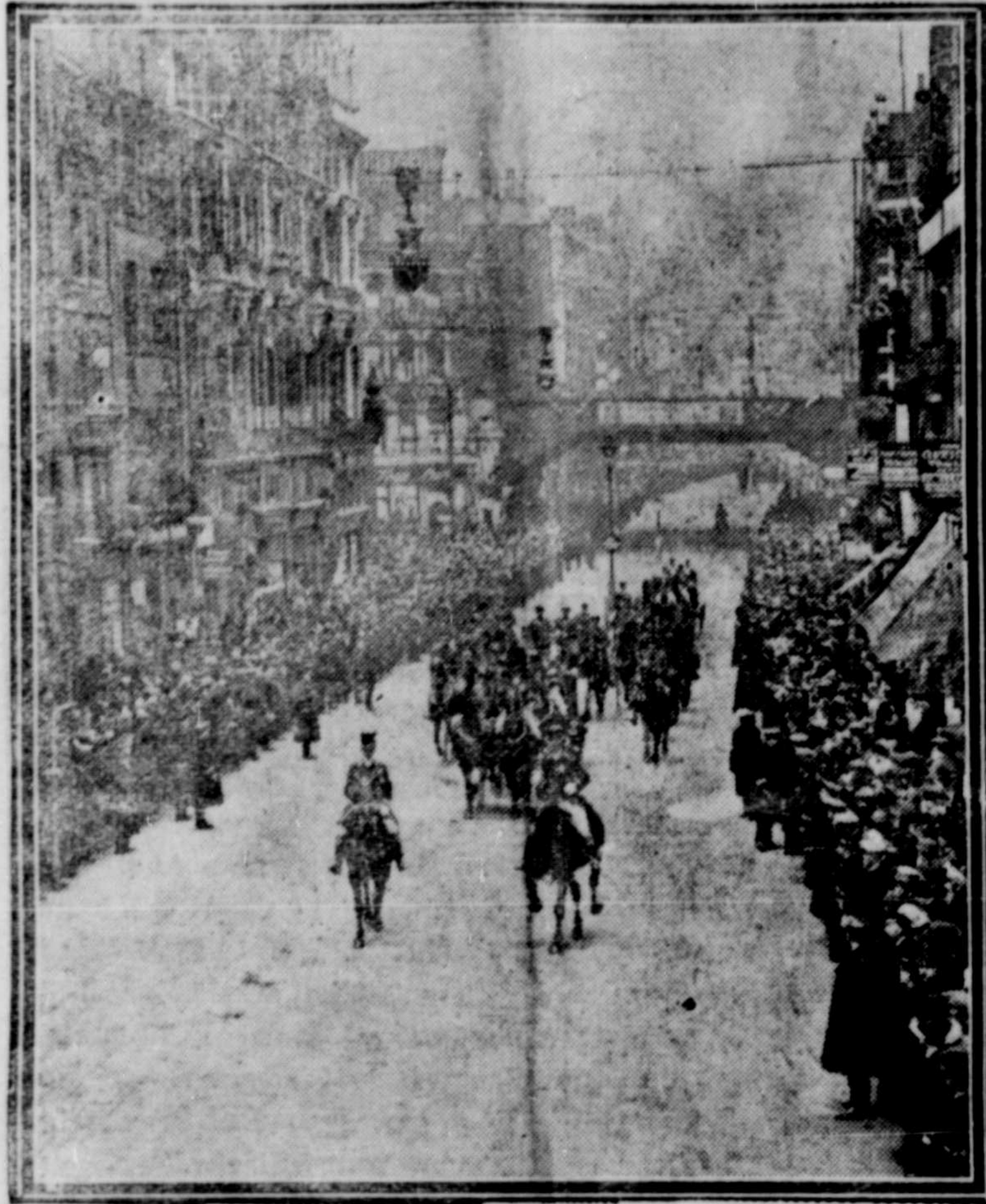
ROYAL PARTY RETURNING FROM KITCHENER SERVICE

London, July 13.—Premier Asquith announces that it will be necessary to extend the present session of parliament. The time taken up in discussing the Irish situation has robbed the house of a great deal of valuable time.