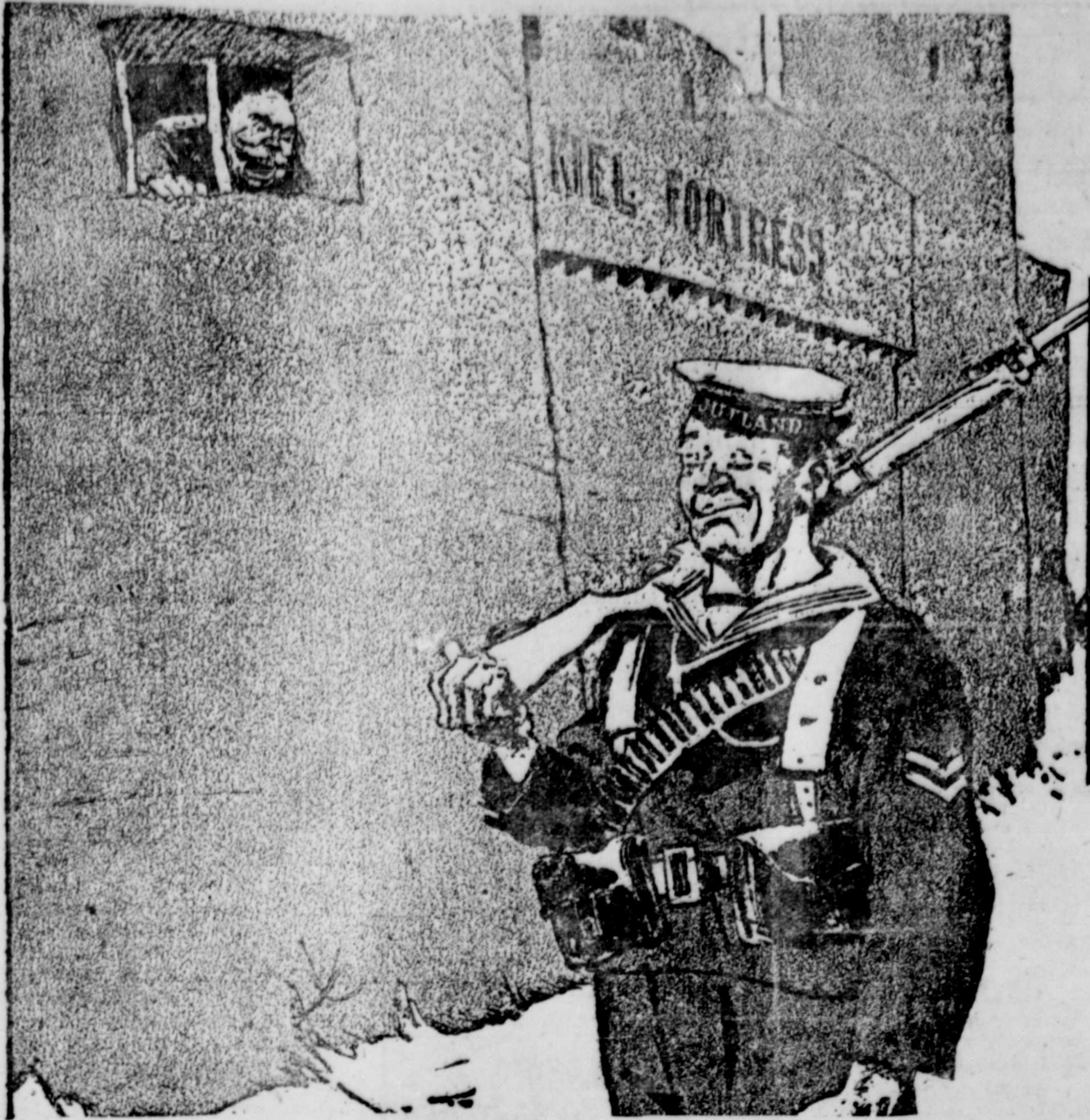
GERMAN NAVY: "How dare you keep me here when all the world knows that I defeated you."—Opinion

TAKE NOTICE that Frederick Bradshaw, of Tonopah, Nevada, occupation mine manager, intends to apply for permission to purchase the following described lands: commencing at a post planted about 200 feet easterly from the northwest corner of Lot 40, Range 4, Coast District; thence north 20 chains; thence west 20 chains; thence south 20 chains more or less to the shore of Surf Inlet, thence following the shore line to the place of commencement, containing forty acres more or less. February 18, 1916. FREDERICK BRADSHAW.