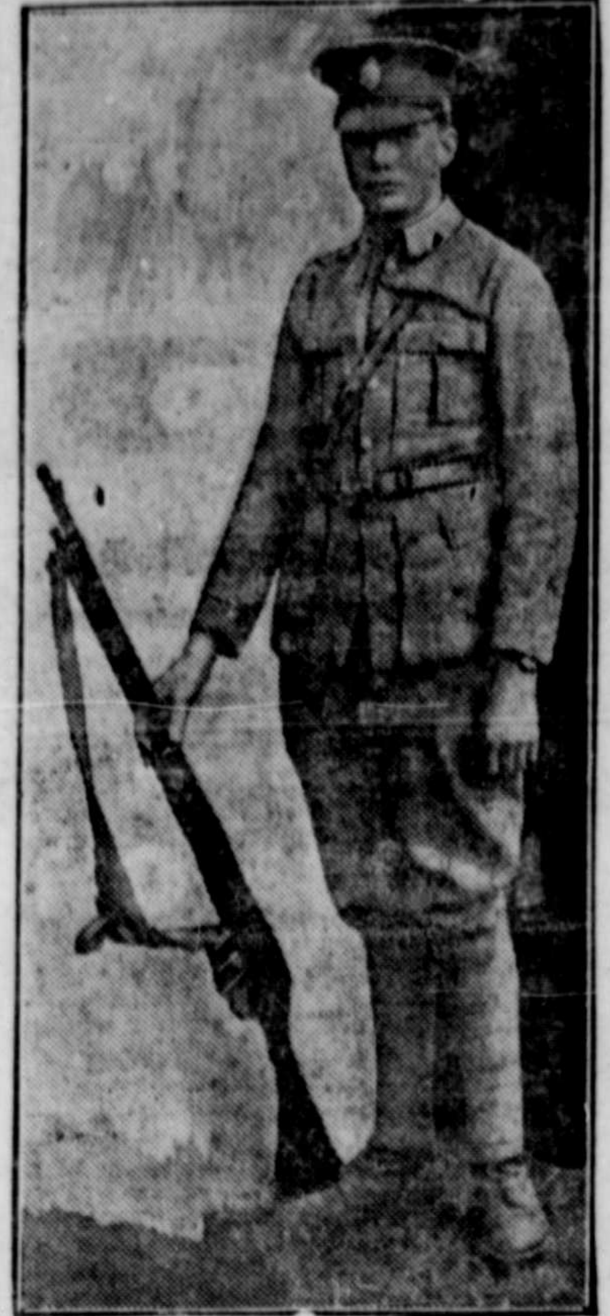
Private Prince Henry of Britain King George's third son in the uniform of a private in the Eton College Training Corps.

The Summer "Life-Savers" are fruit, cereals and green vegetables. Meat in Summer overtaxes the liver and kidneys, potatoes cause intestinal fermentation. Get away from the heavy Winter diet; give Nature a chance. One or two Shredded Wheat Biscuits , served with milk or cream or fresh fruit, make a deliciously nourishing, satisfying meal. Such a diet means good digestion, good health and plenty of strength for the day's work. All the goodness of the wheat in a digestible form. For breakfast with milk or cream; for luncheon with fresh fruits. Made in Canada