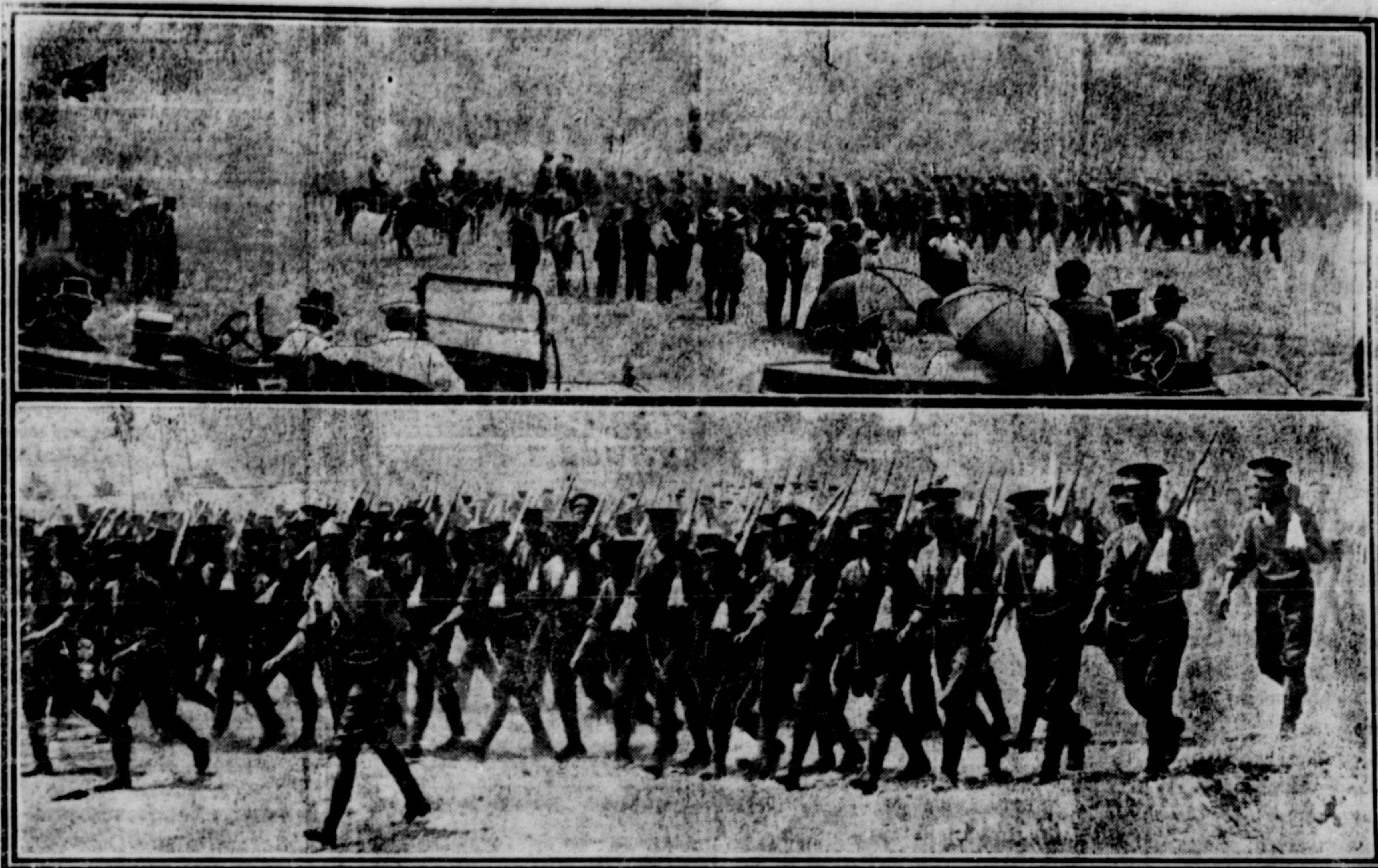
OVER THIRTY THOUSAND CANADIAN TROOPS ON PARADE.—This picture shows Sir Sam Hughes reviewing thirty-one thousand troops from all parts of Canada at Camp Borden, the largest camp in Canada. The pictures show the thick dust which is stirred up by the marching of the soldiers, which, combined with the intense heat, was the cause of a riotous outbreak in this camp.

SAFETY FIRST—USE NEW WELLINGTON COAL, PHONE 16.