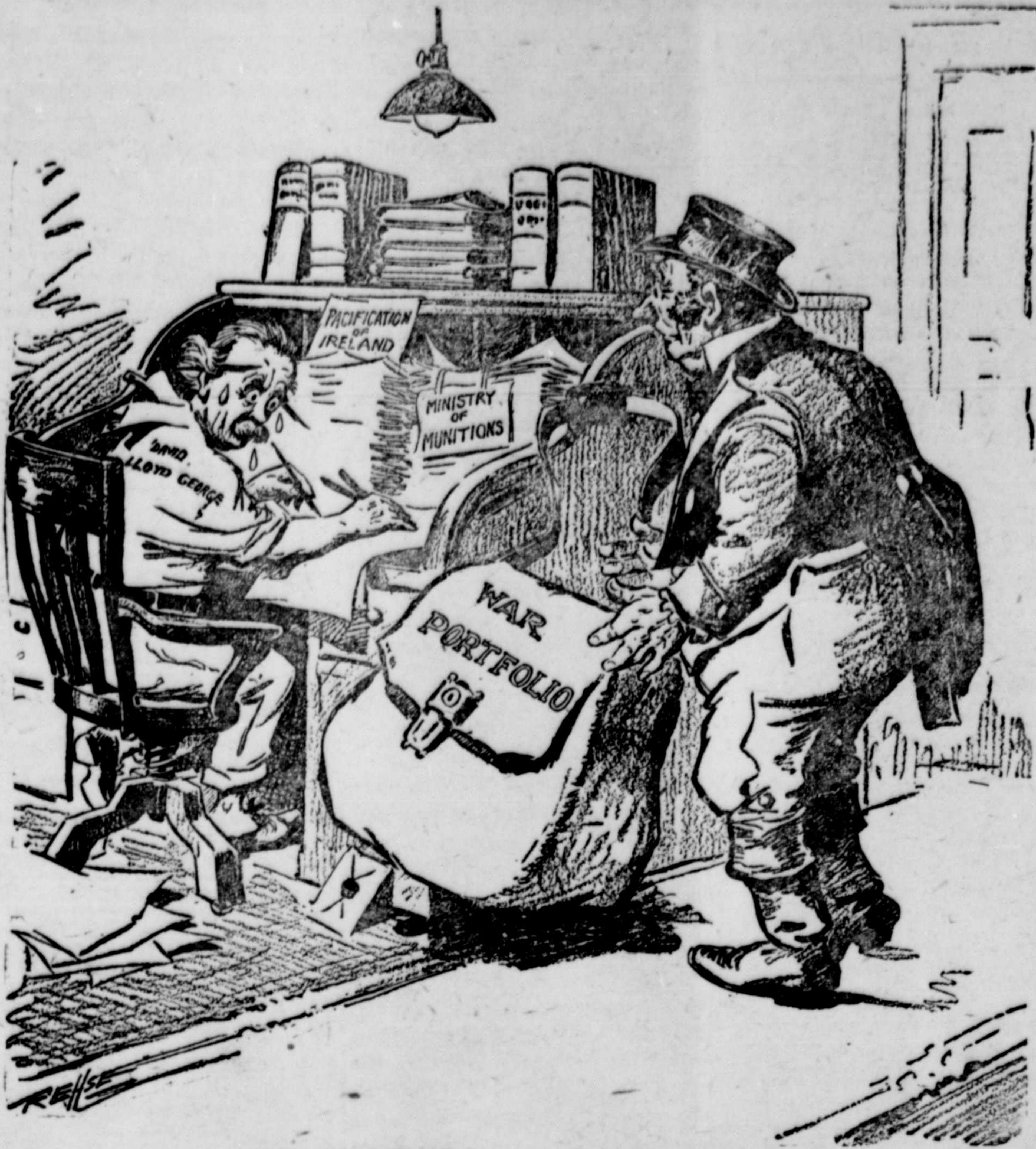
"LET GEORGE DO IT".—Cartoon from New York World.