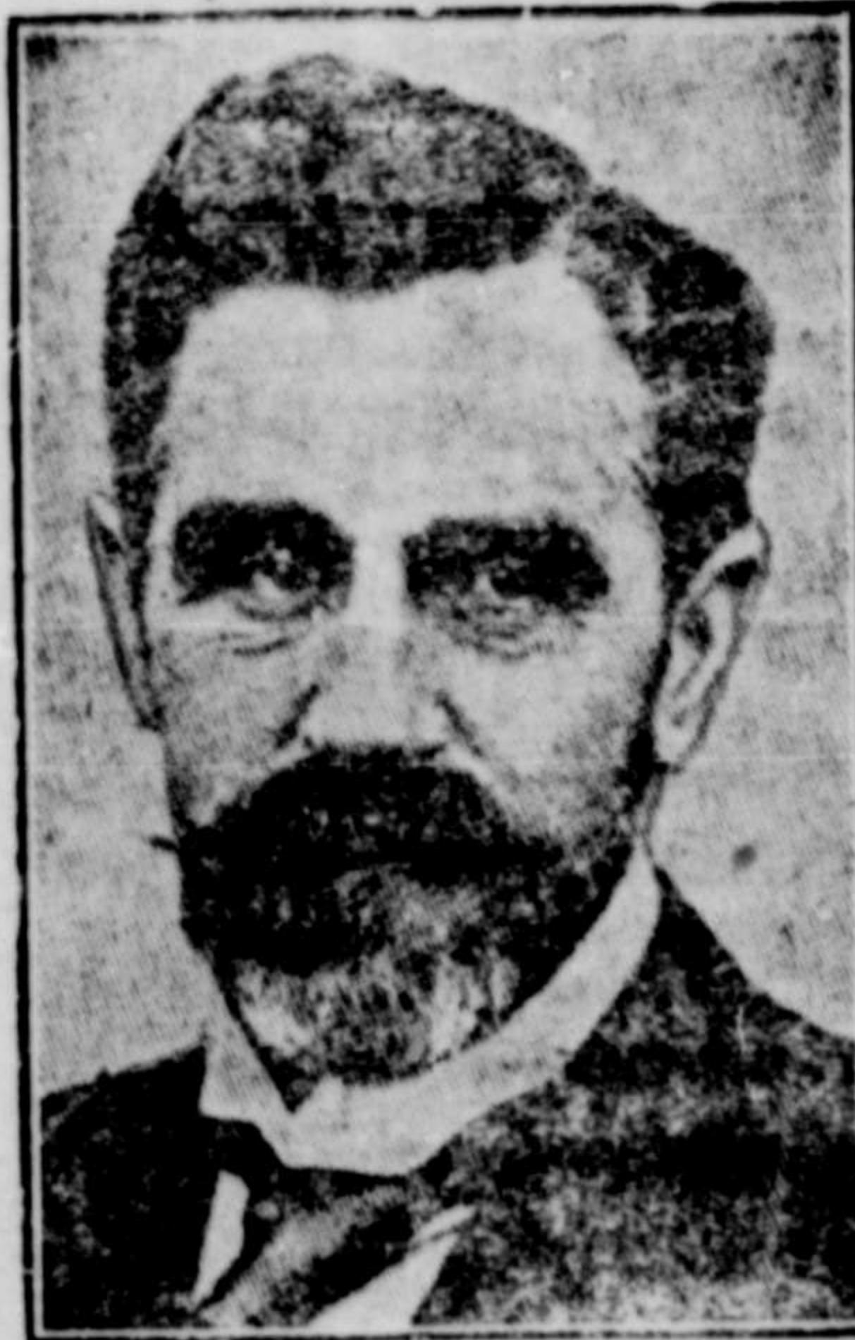
SIR ROGER CASEMENT

The Hotel Rupert bulletin says that the British have taken eleven German strongholds in the past month, taking 13,000 prisoners, while the Germans have lost 100,000 killed and wounded.