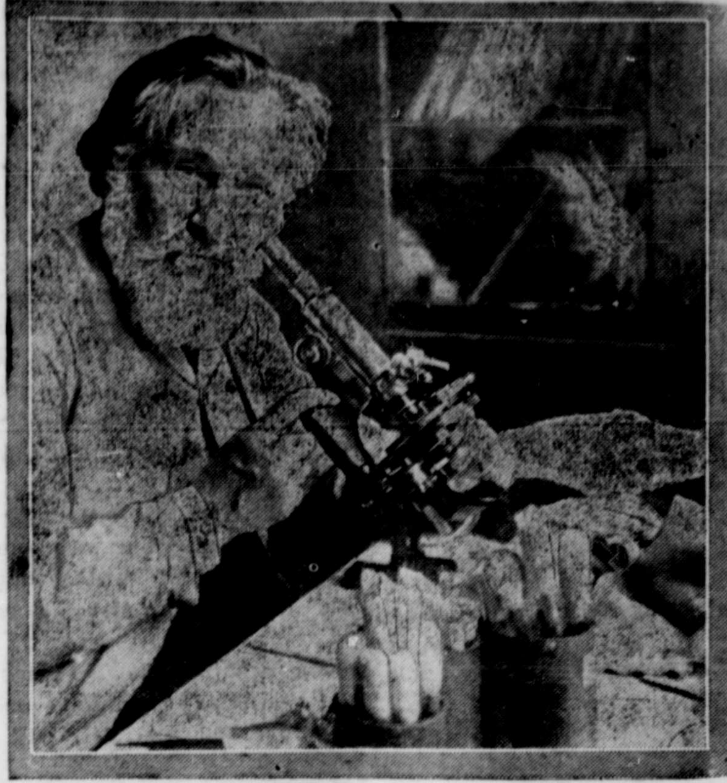
Professor Metchnikoff, the noted scientist, who died recently.