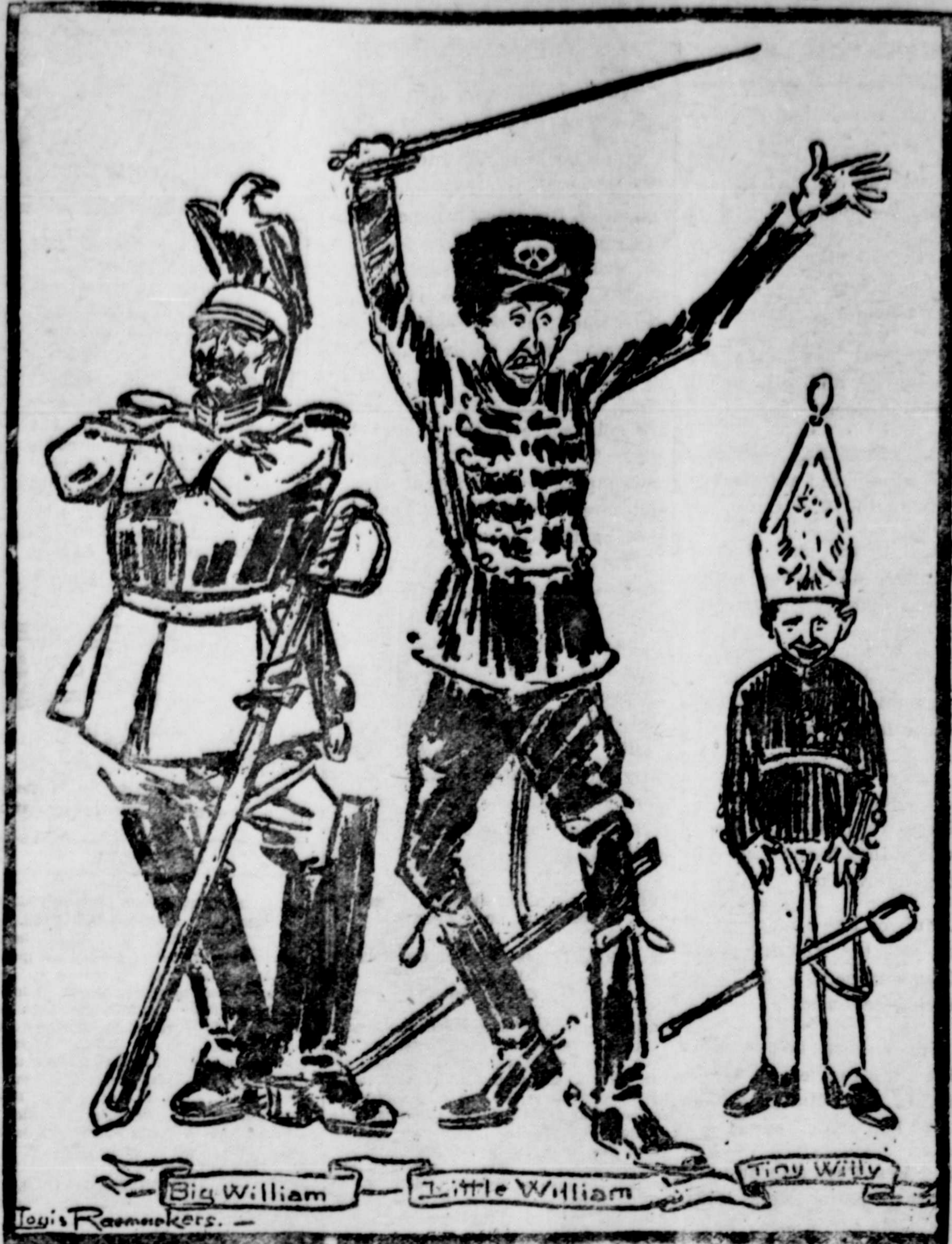
THE THREE DEGENERATIONS: "The Kaiser has appointed his grandson, Prince Wilhelm, the ten-year-old son of the Crown Prince, a lieutenant in the First Regiment of Foot." This is a message from a correspondent at Amsterdam. (Cartoon specially drawn for "The Daily Mail," London by Louis Raemaekers.

Salvation Army. Public meetings, Tuesday, Thursday and Saturday at 8 p.m. Sundays at 7:30 p.m.