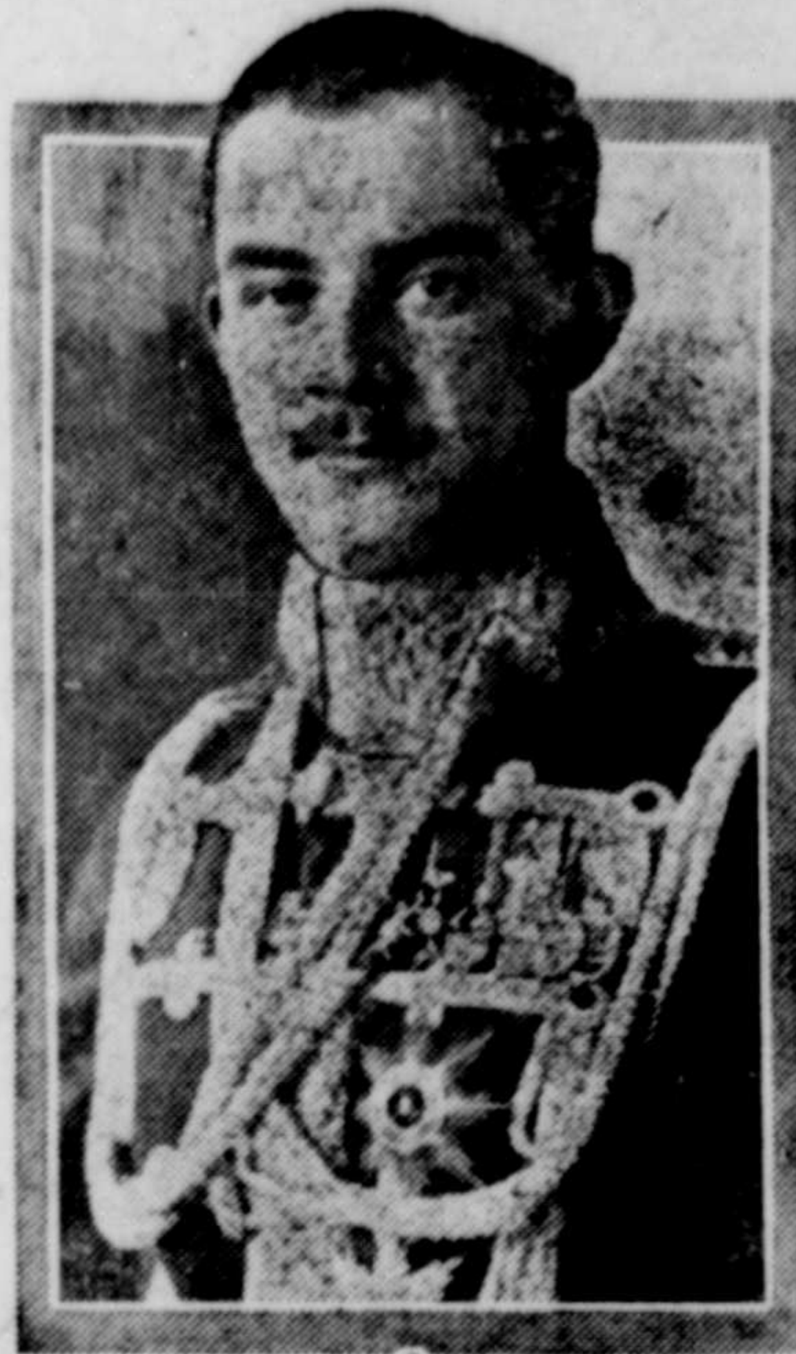
DUKE OF BRUNSWICK

That Waltham watch at Cavanaugh & Hannan's is yours if you can guess when it will stop. This is your last opportunity. 190.