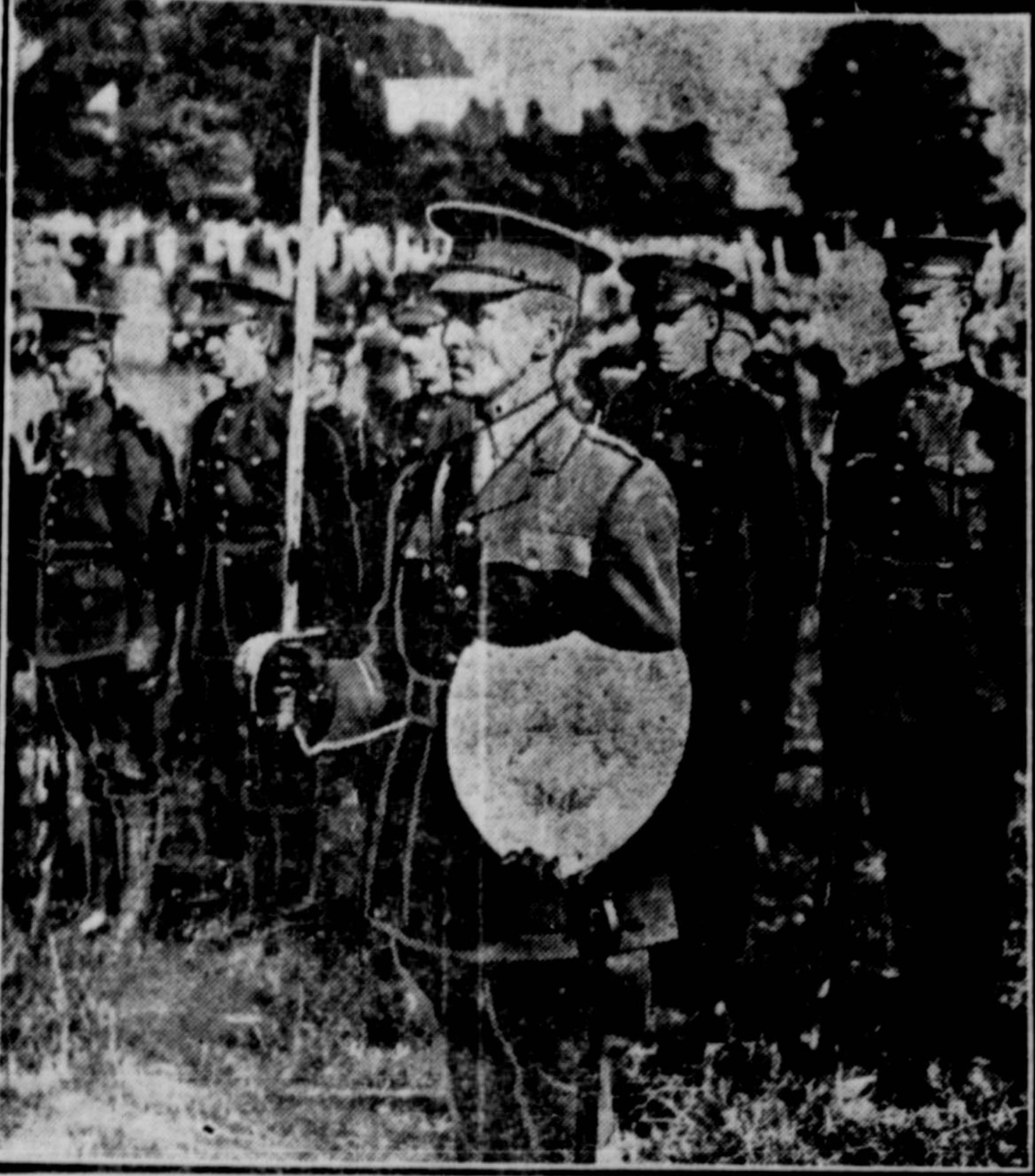
CANADIANS RECEIVE UNIO. JACK AND SHIELD

These two pictures show the presentation by the Duchess of Argyll to representatives of the Canadian troops assembled in the grounds adjoining Buckingham Palace, of a flag and shield, the gift of the women and children of England.