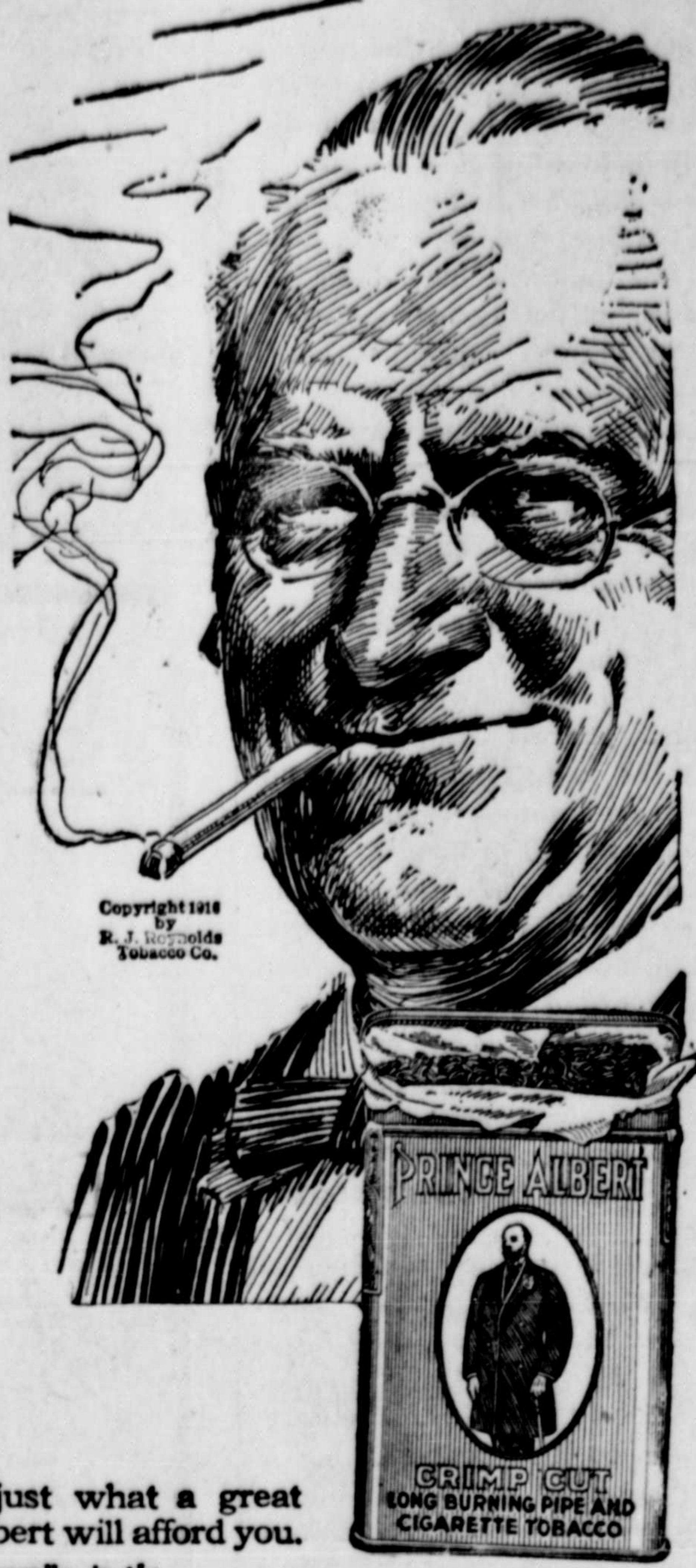
Copyright 1916 by R. J. Reynolds Tobacco Co.

R. J. REYNOLDS TOBACCO CO., Winston-Salem, N. C., U. S. A.