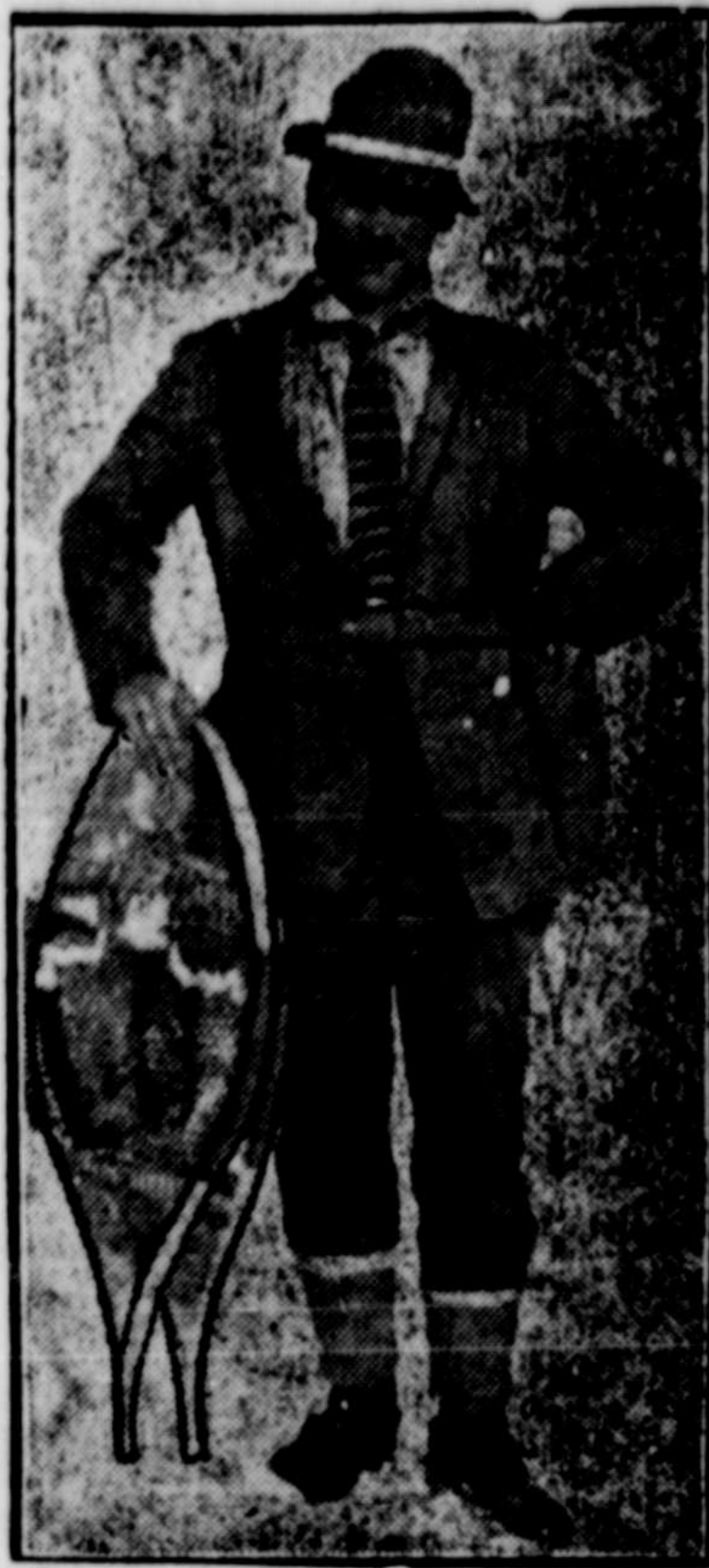
THE HERO OF MATHESON