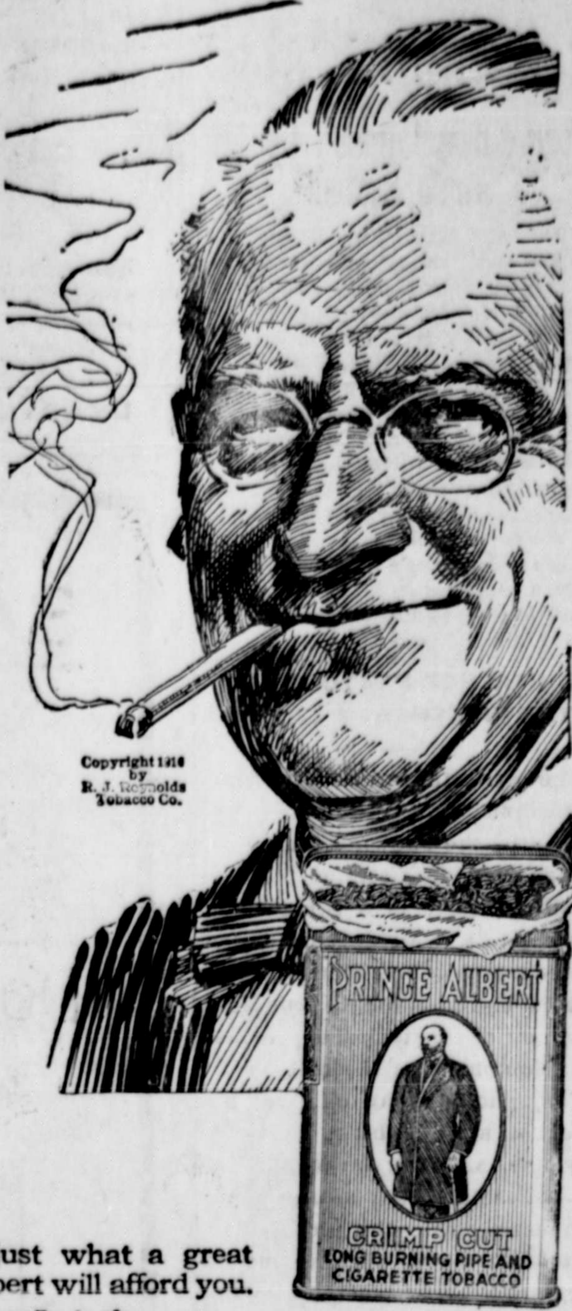
Copyright 1916 by R. J. Reynolds Tobacco Co.

R. J. REYNOLDS TOBACCO CO., Winston-Salem, N. C., U. S. A.