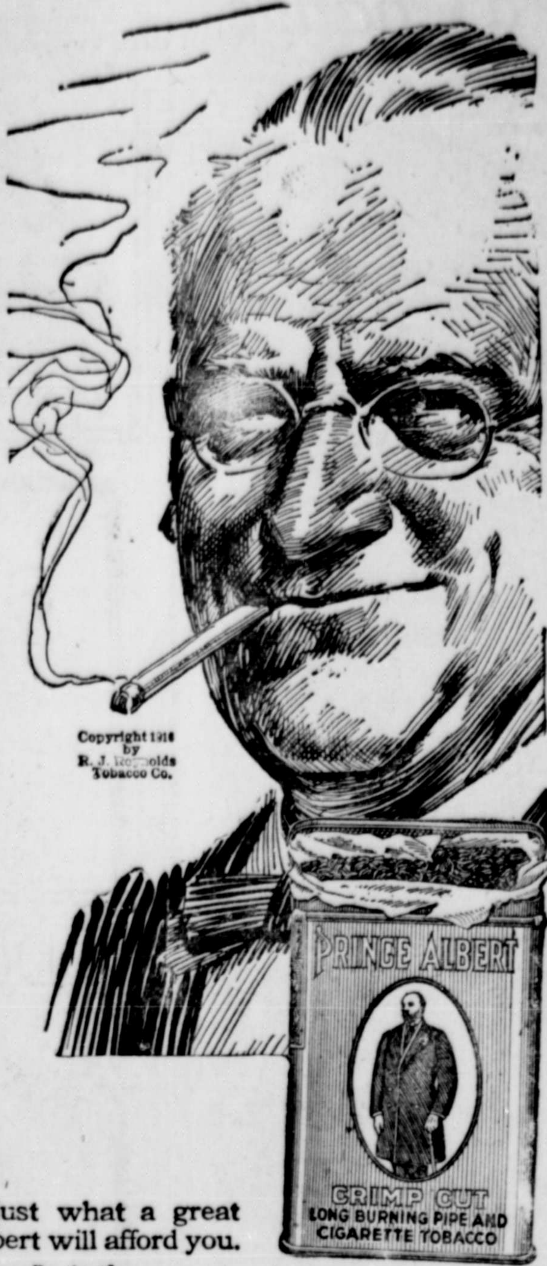
Copyright 1916 by R. J. Reynolds Tobacco Co.

R. J. REYNOLDS TOBACCO CO., Winston-Salem, N. C., U. S. A.