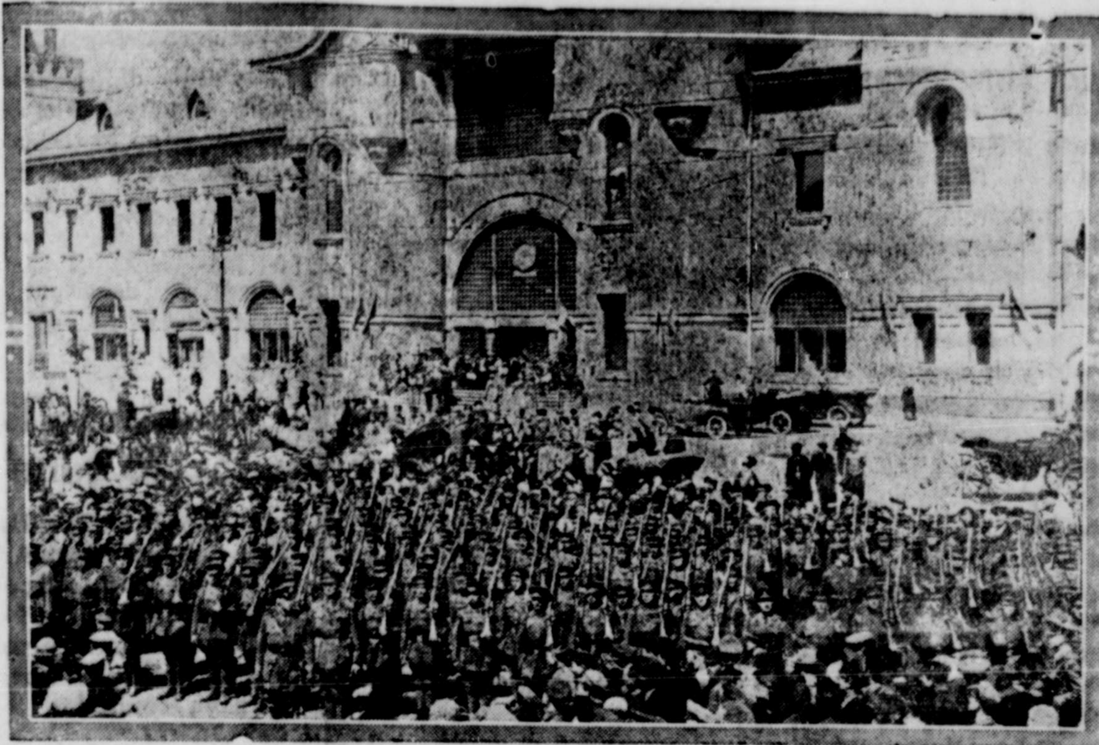
FIRST PICTURE OF BRITISH SOLDIERS IN RUSSIA.—This battalion of British troops is drawn up in front of the railway station in Moscow prior to leaving for the Russian battle front.

Good reliable man wanted. Phone Fritz, 249.