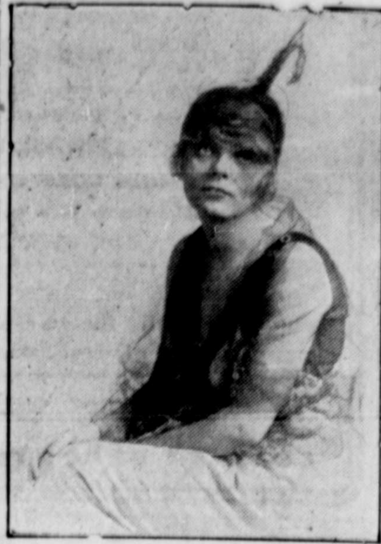
Blanche Sweet in "The Black-List" at the Majestic tonight.