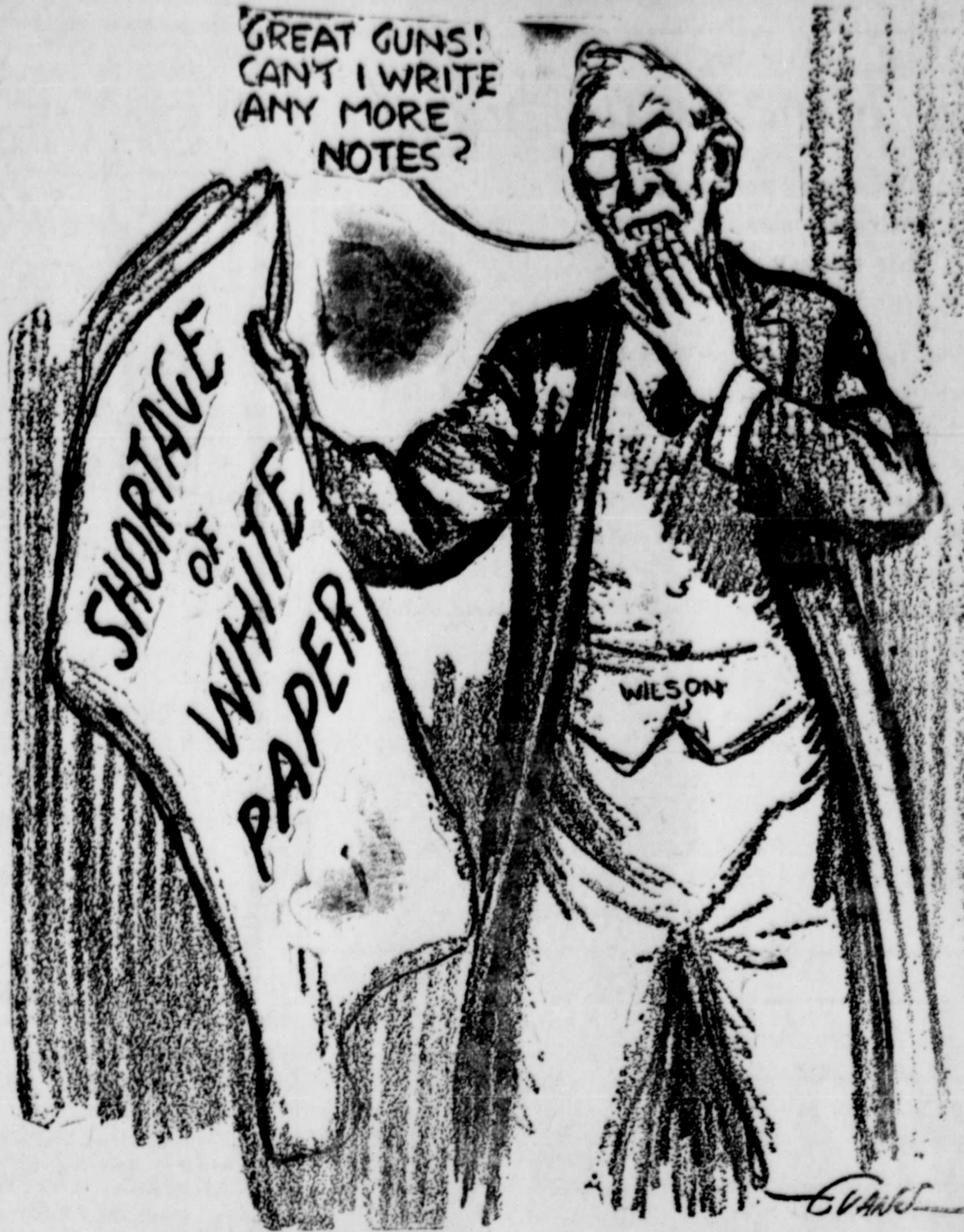
"THE SCAREHEAD" —Cartoon from Baltimore American.