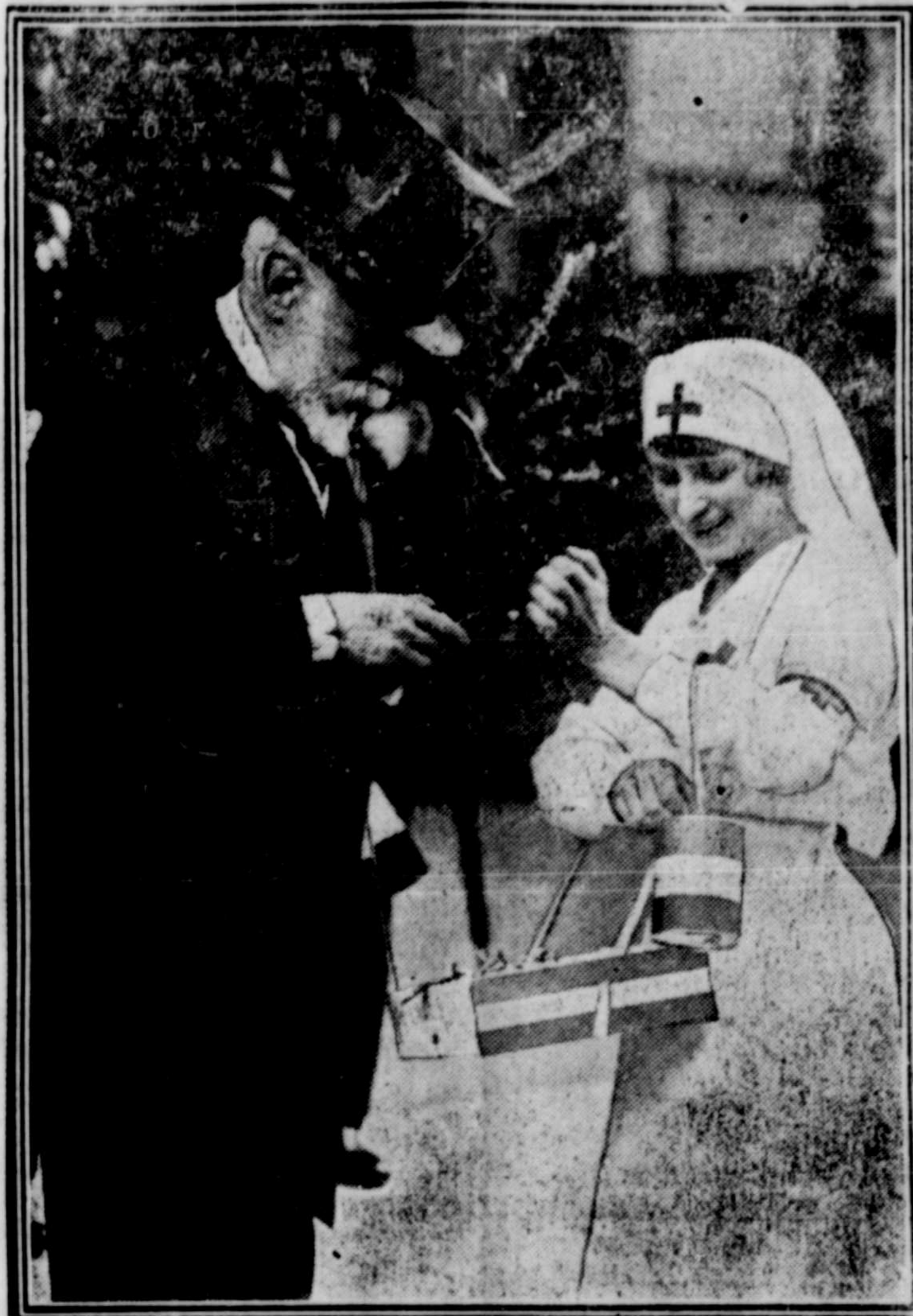
FRENCH AMBASSADOR "TAGGED" IN LONDON