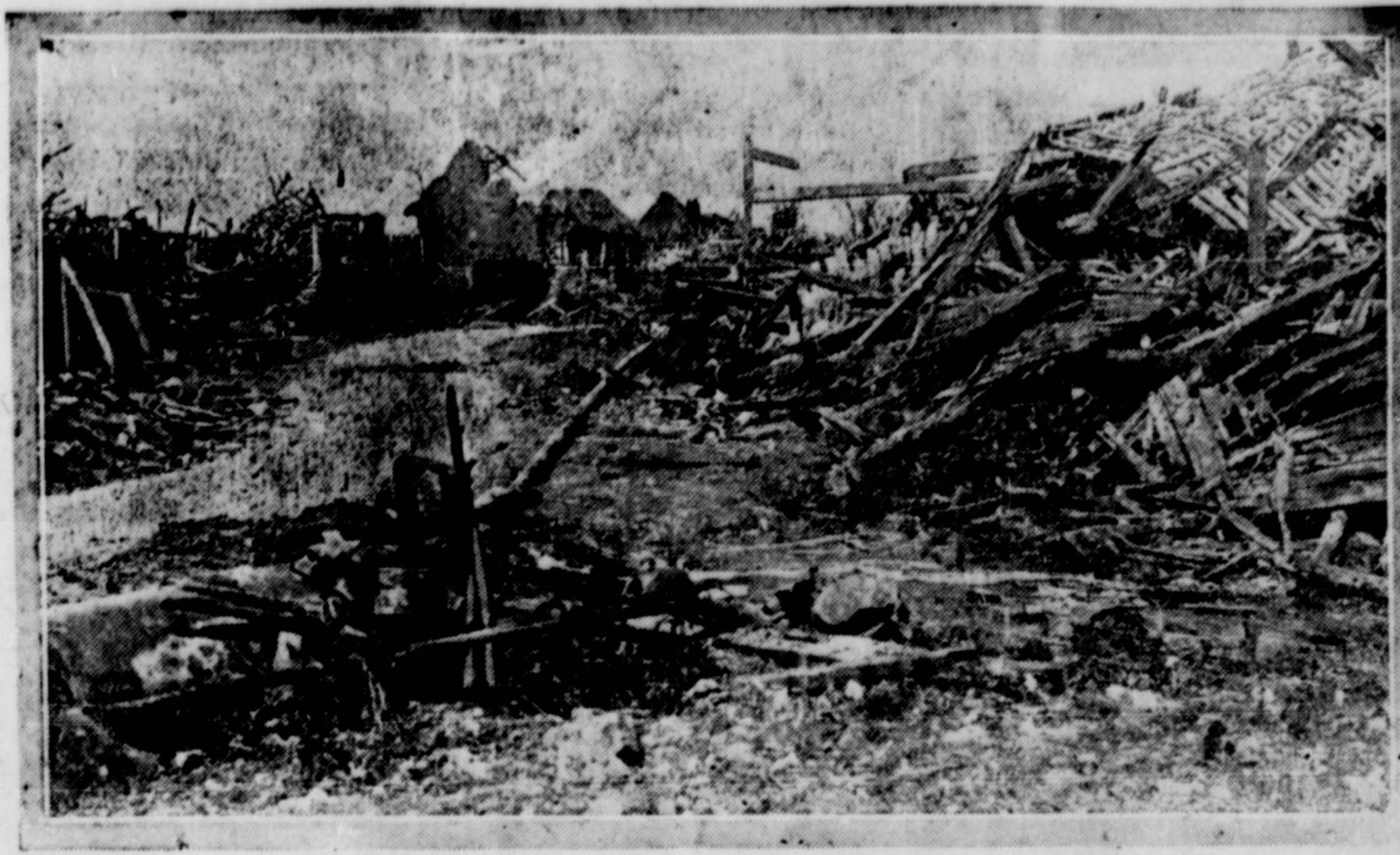
OFFICIAL PICTURE OF MAMETZ AFTER CAPTURE BY THE BRITISH.—This picture shows clearly the terrible havoc wrought by the British heavy artillery.