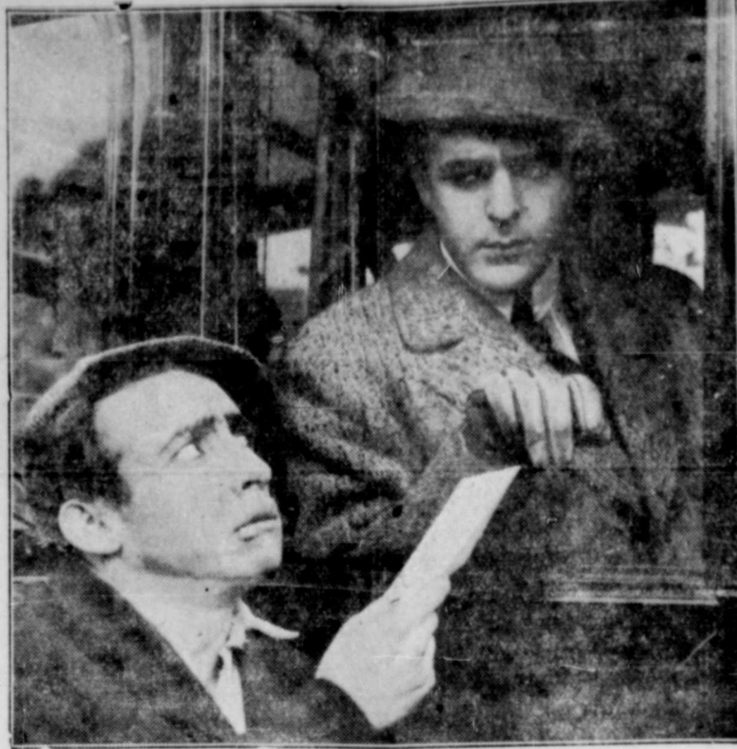
Scene from "The Golden Chance" showing at the Majestic tonight.