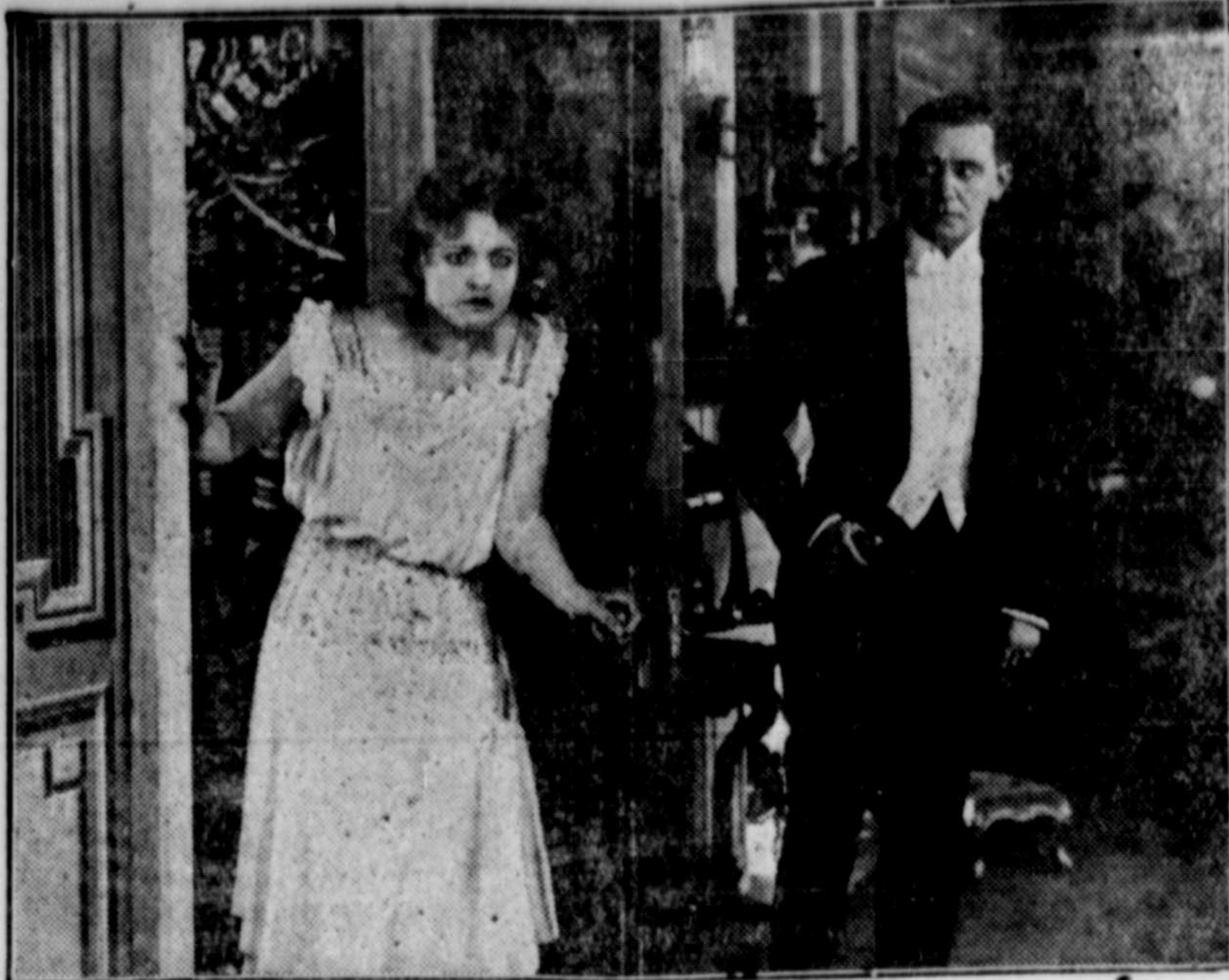
SCENE FROM "THE MUMMY AND THE HUMMING BIRD" AT THE MAJESTIC THEATRE TONIGHT

For Sale Only by Geo. L. Clayton, - Prince Rupert, B.C.