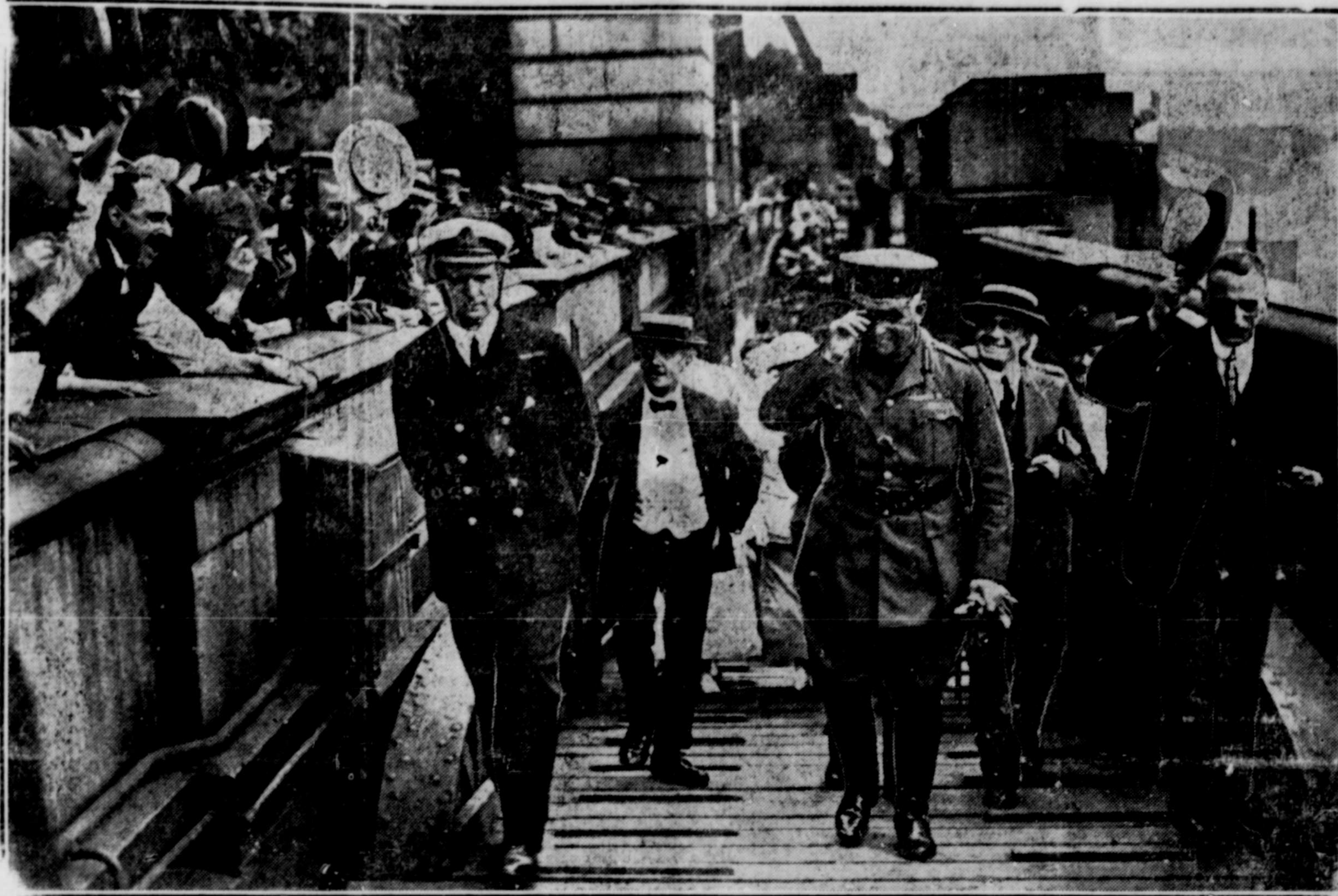
SIR SAM HUGHES ENJOYING HIMSELF IN OLD ENGLAND.—Sir Sam is a hero in England, at least to the English crowd. In the picture he is seen acknowledging the cheers of a crowd on the Thames embankment on his return from a visit to the captured German submarine mine-layer which is being exhibited at Temple Pier.