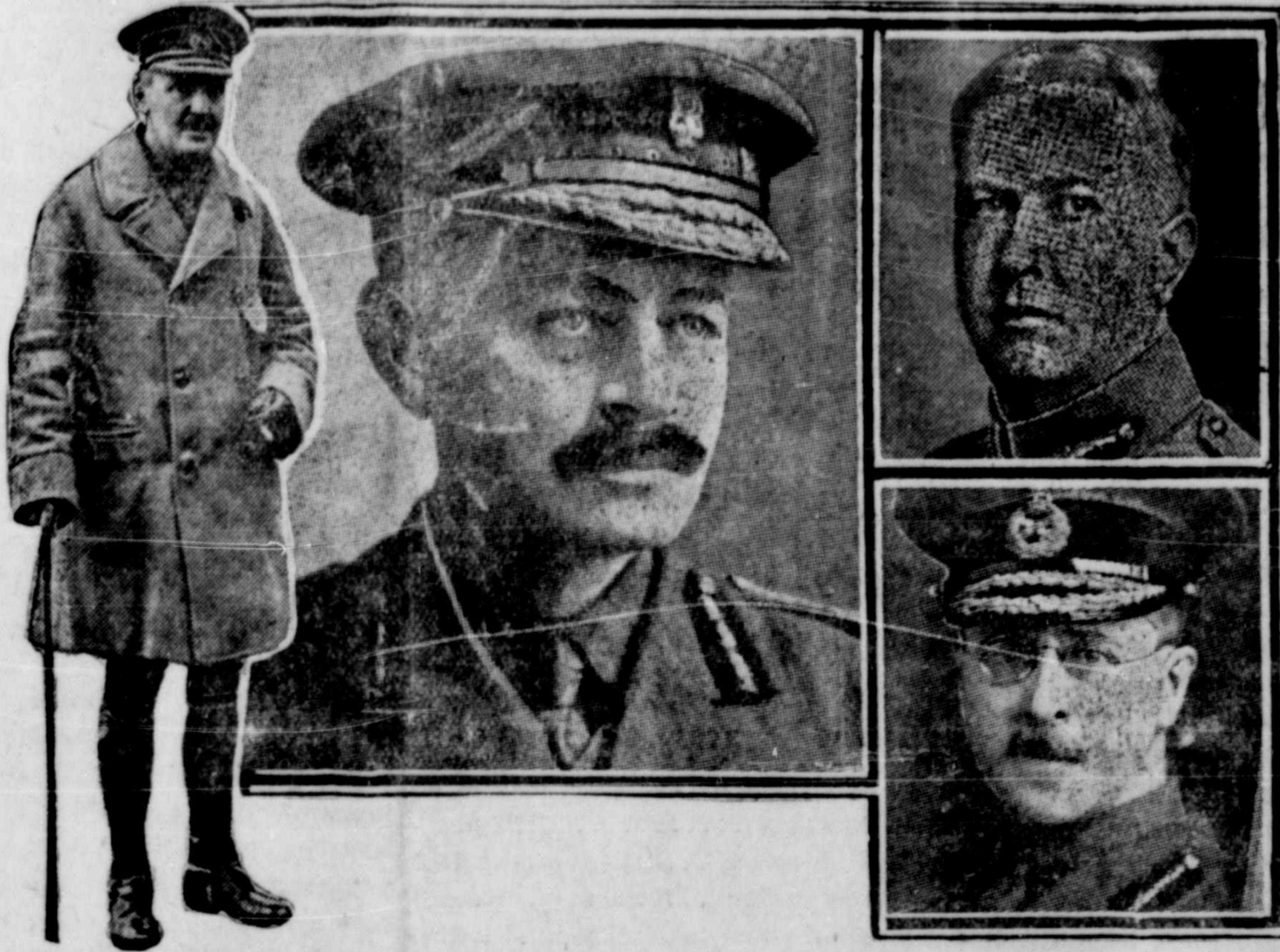
CANADIAN COMMANDERS ON THE SOMME FRONT.—The Canadians, moving from the Ypres salient, the scene of many bloody encounters, to the Somme front, are under the command of Lieut.-General Sir Julian Byng. (second picture); Division commanders are Major-General L. G. Lipsett (left); General A. W. Currie, (upper right), and General R. E. W. Turner, V. C., D. S. O., (lower right); also General Daniel Watson whose picture is not included.