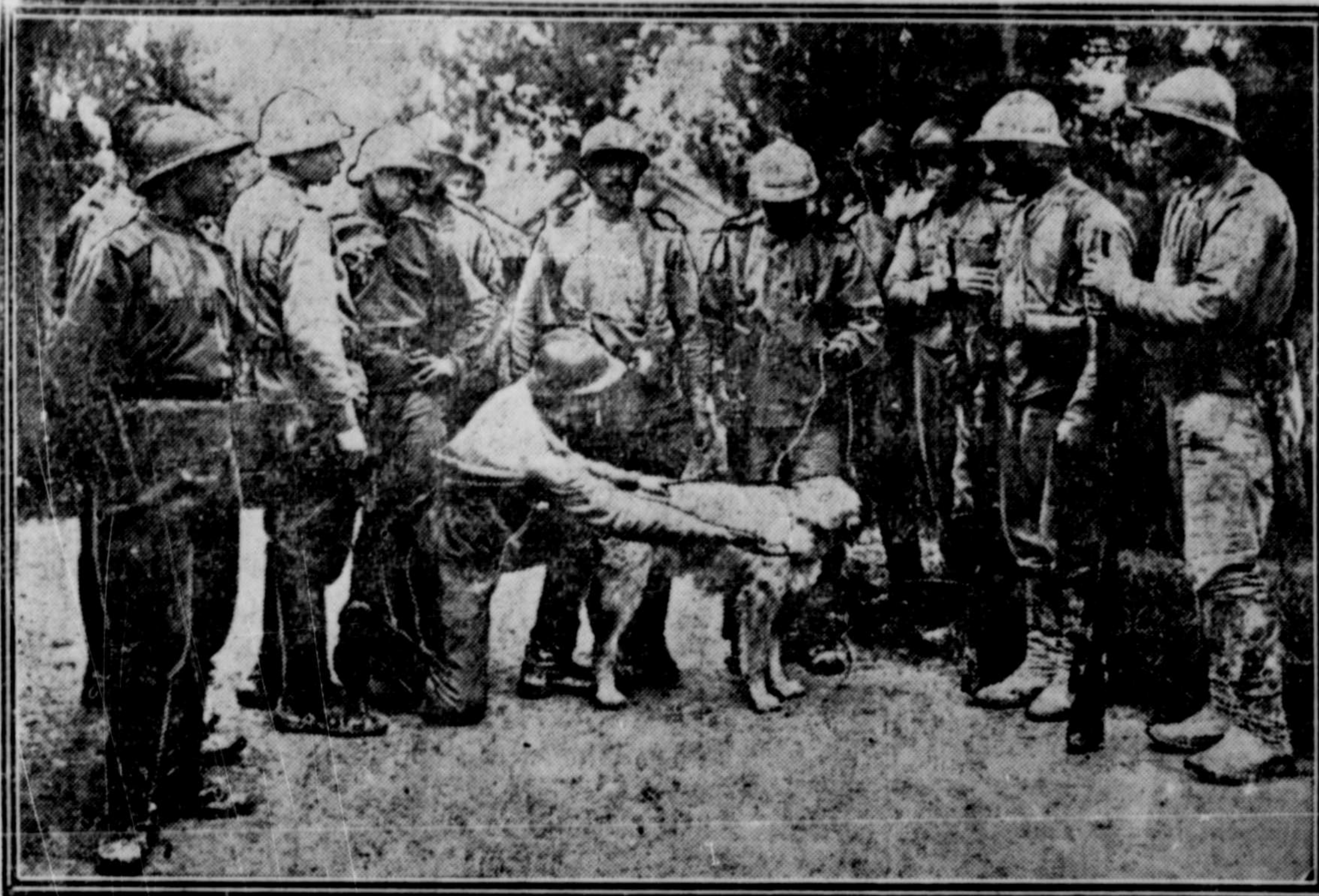
WITH OUR RUSSIAN ALLIES ON THE WESTERN FRONT.—This picture shows Russian soldiers in the Champagne district of France returning from a recent big battle, carrying with them a German war dog (scout) which they captured.