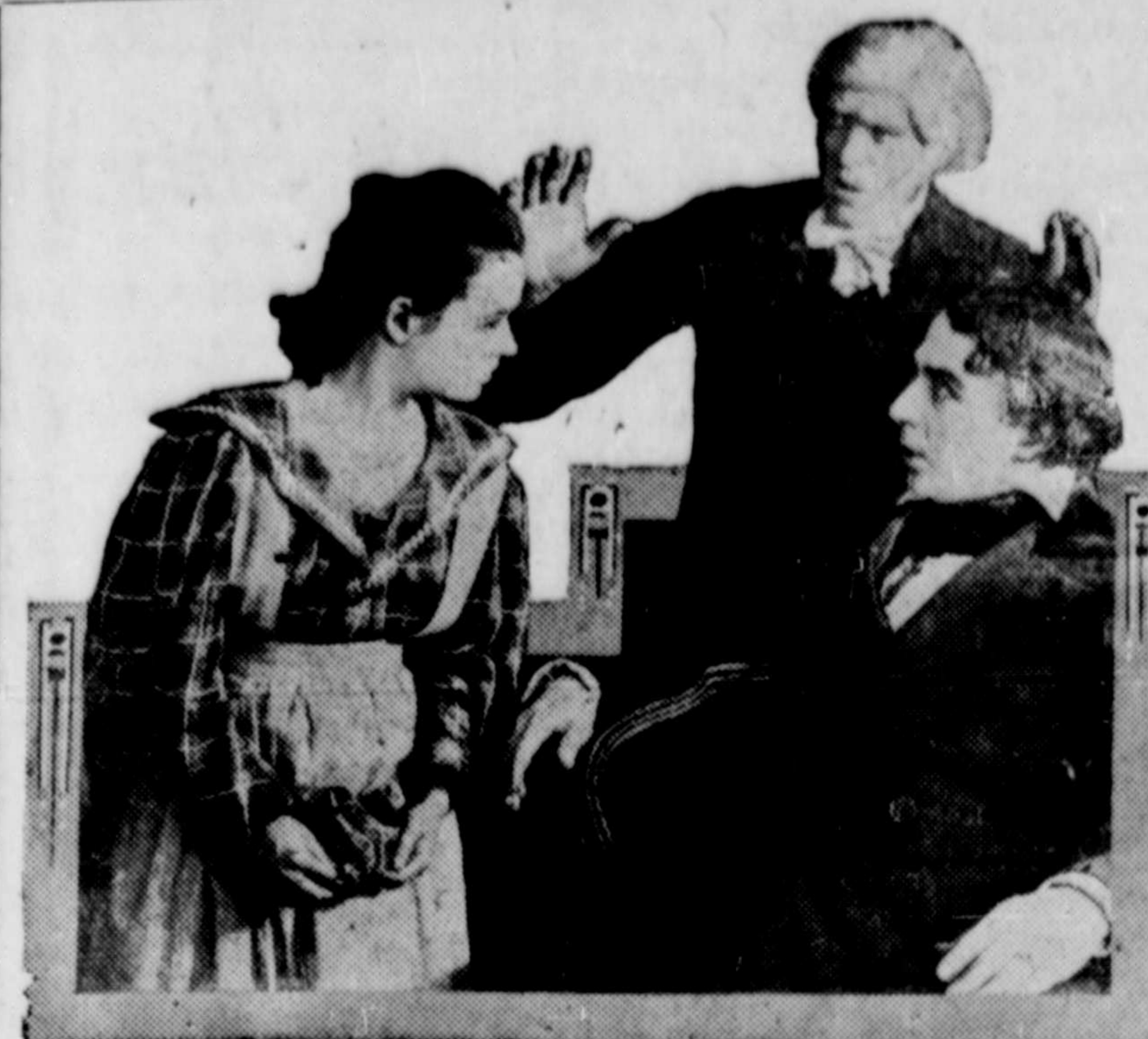
Mary Pickford in "The Foundling" at the Majestic tonight.

The Colts and C. C.'s met yesterday afternoon at the sports in a competition for $25. The C. C.'s looked easy winners up to the ninth, when they led by four runs, but the Colts got the pitcher rattled and took things into their own hands, getting five runs and running out winners by the odd run in the last.