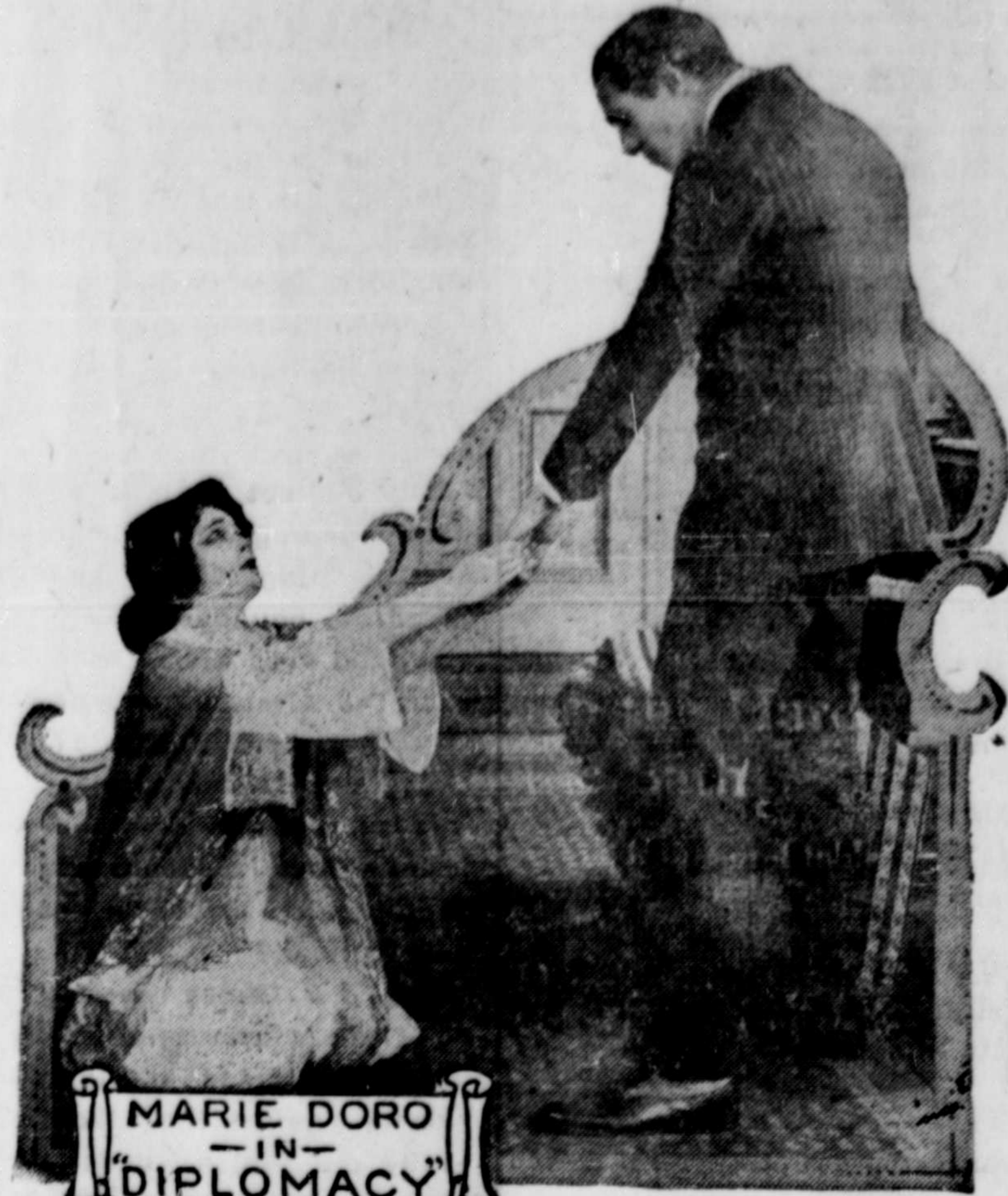
SHOWING AT THE MAJESTIC THEATRE TONIGHT.

"On the other hand here is the 'gold-brick.' There is nothing like prohibition in the bill. It will not diminish the consumption of alcoholic beverages, but will increase the purchase of strong liquor. It will turn the home into a saloon, and the drug store into a liquor shop, where subterfuge, deceit and false pretence will become common and open, in order to obtain liquor. It will take a standing army to enforce it, if indeed, twenty-five thousand extra provincial police could do so. It is un-British in principle; the right to search a man's home