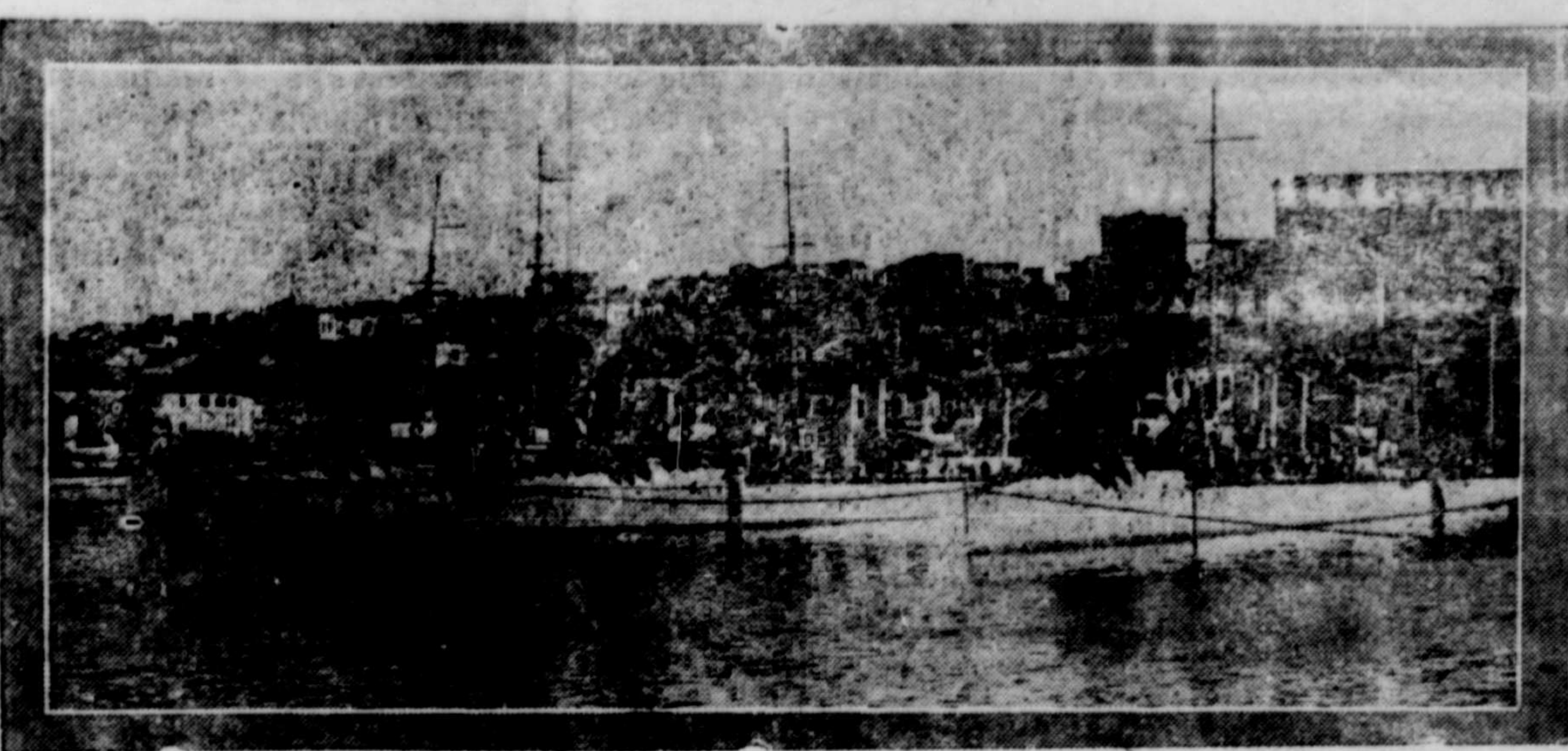
PIRAEUS AND ATHENS UNDER GUNS OF SIXTEEN BRITISH WARSHIPS. —The harbor of Piraeus showing Greek war vessels at anchor. Allied warships are also anchored nearby.