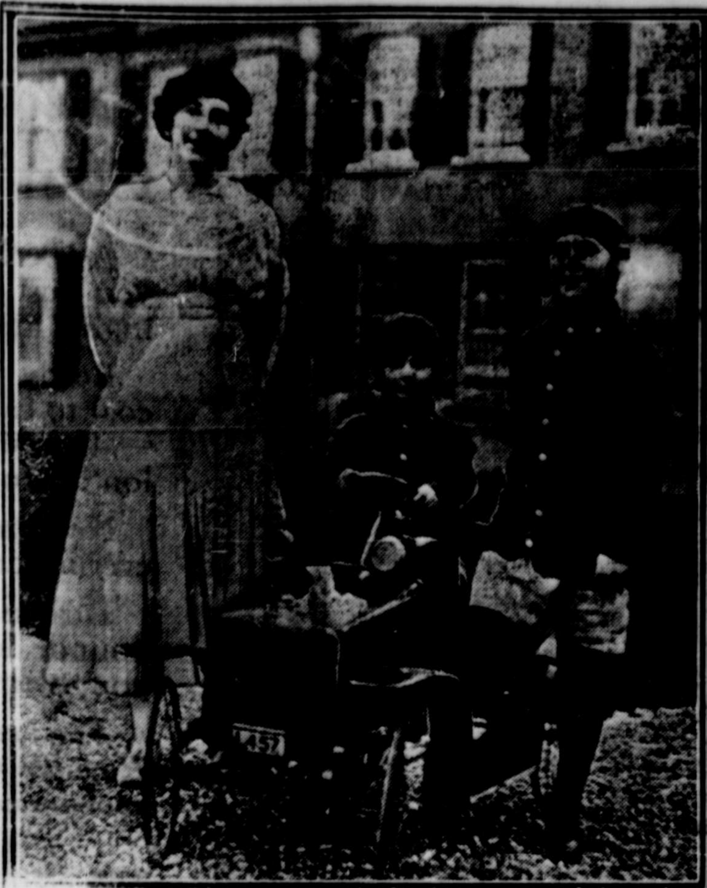
AN INTERESTING IRISH SNAP-SHOT

The commercial exhibits are fewer this year than formerly.