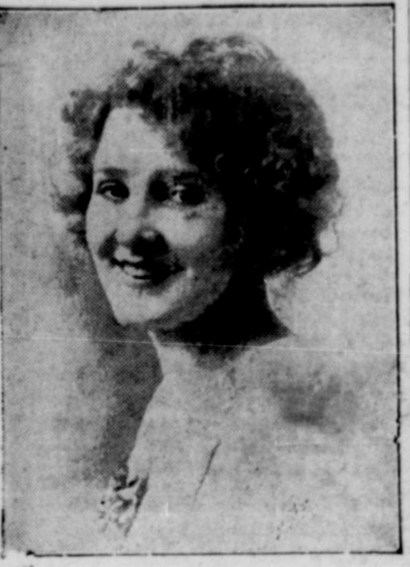
Hazel Dawn in "The Saleslady" at the Majestic Theatre tonight.