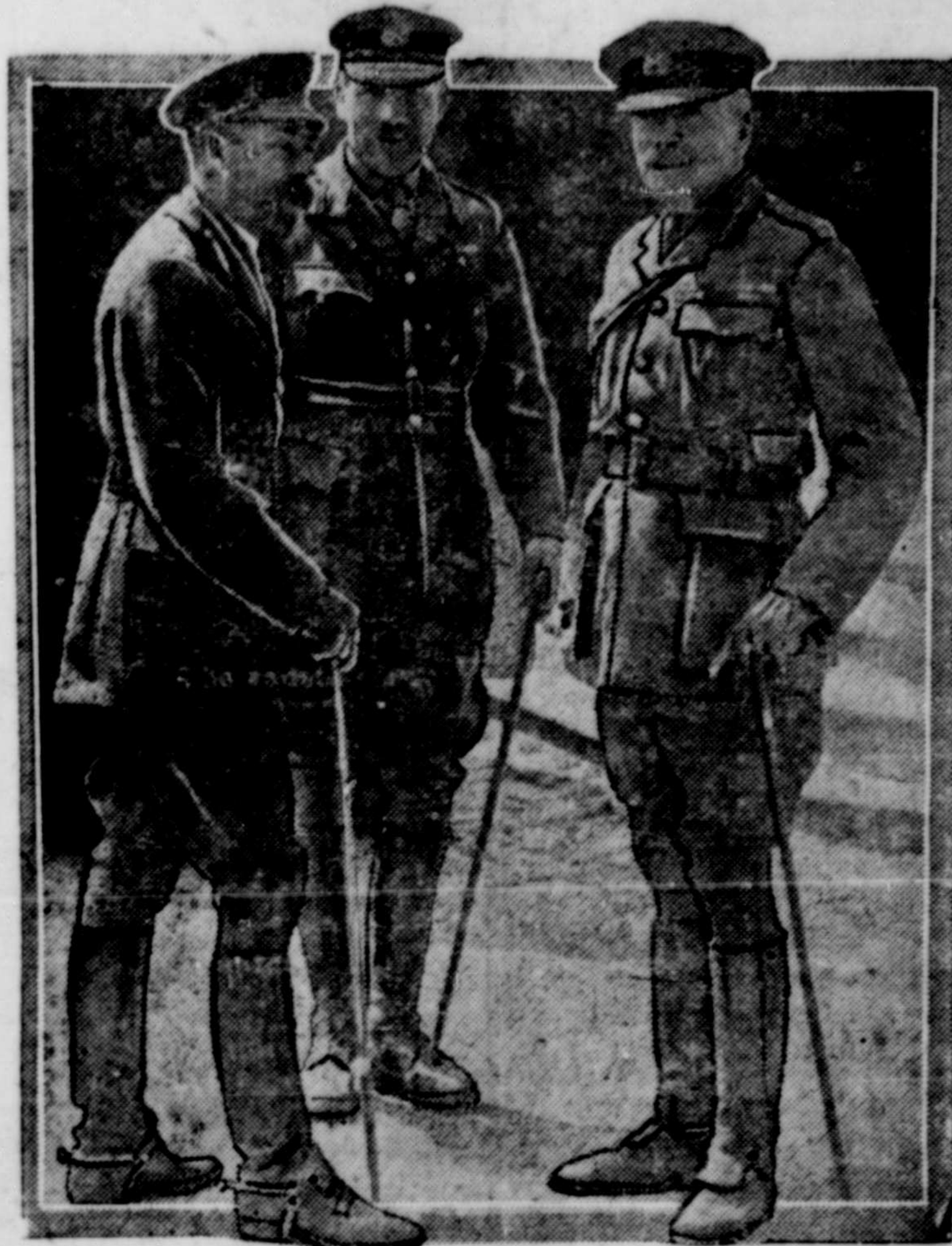
THE KING VISITS THE FRENCH FRONT

(Special to The Daily News.) Edmonton, Sept. 29.—It is rumored that there will be a general election in the province of Alberta on October 23rd.