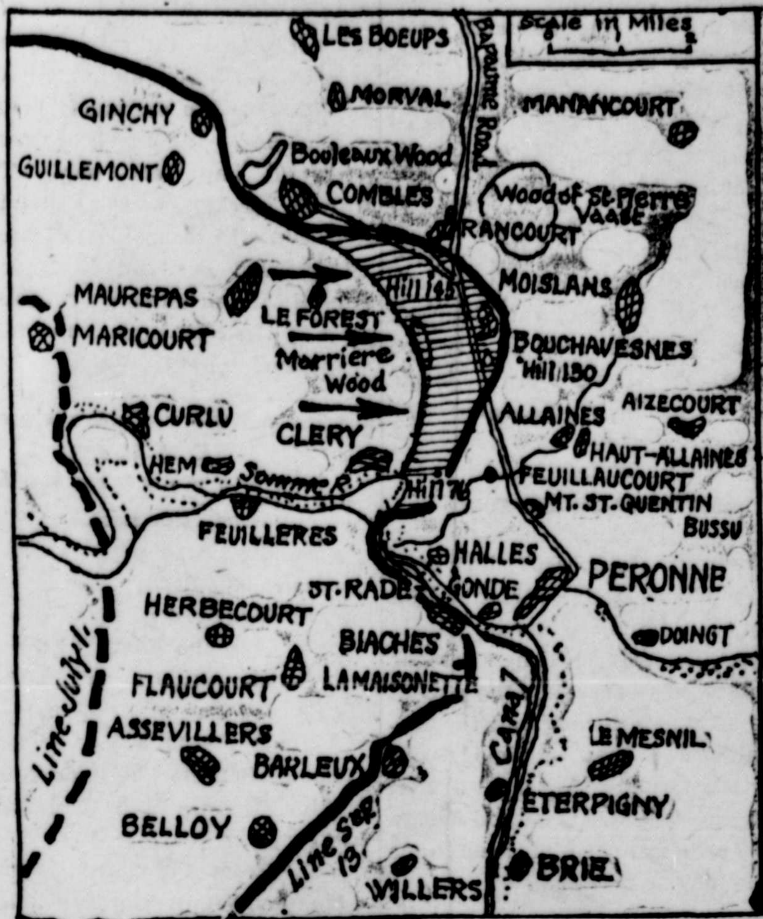
FRESH ADVANCE BY FRENCH NORTH OF SOMME

(Special to The Daily News.) Quebec, Oct. 5.—Three hundred delegates who visited the provincial parliament advocating that prohibition be adopted in Quebec were notified that the government's views on this question had undergone no change.