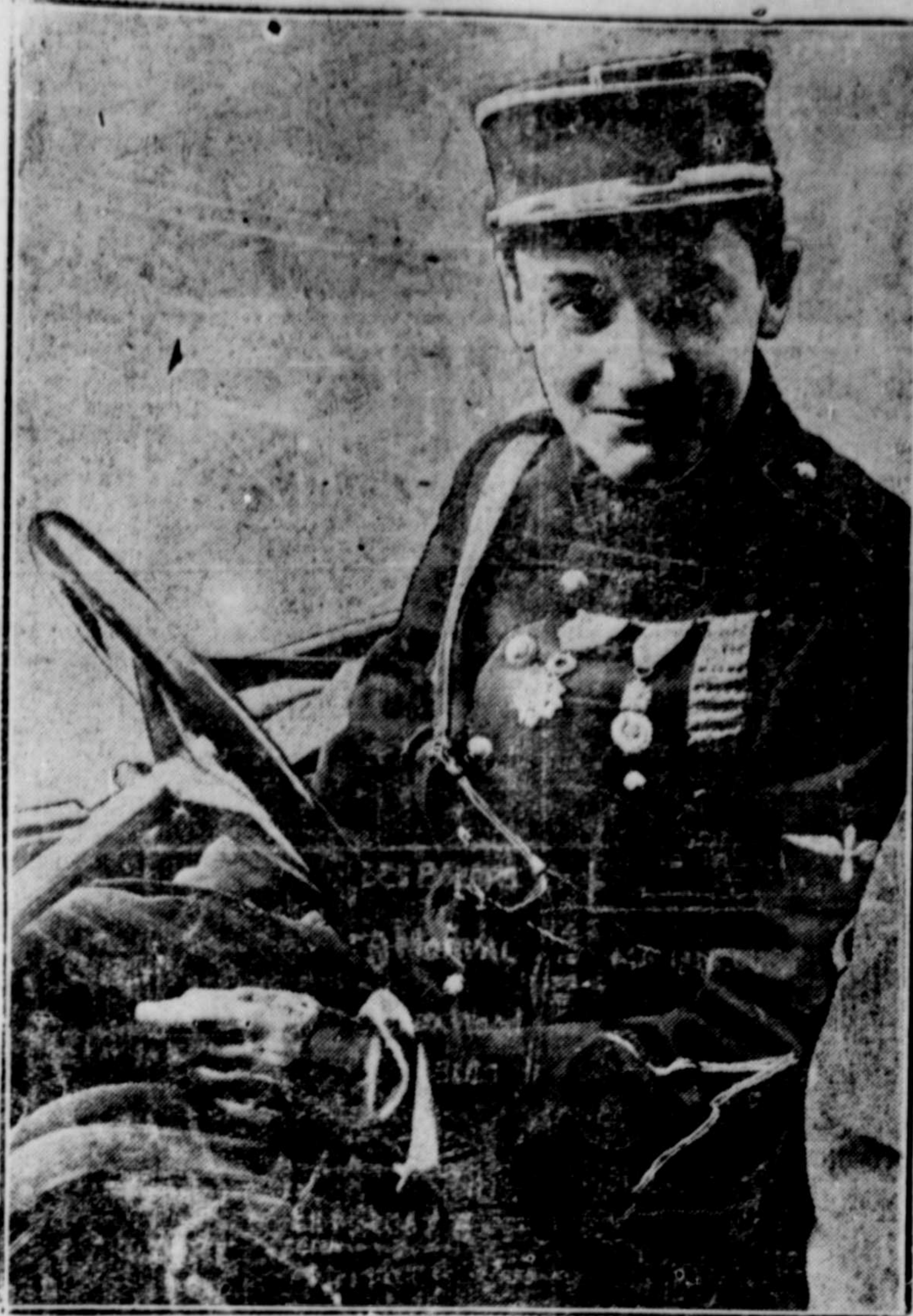
LIEUTENANT GUYNEMER , the most daring of French aviators, who brought down three German aeroplanes in two and a half minutes the other day and then dropped ten thousand feet to earth and alighted unhurt. He is known throughout France as the "Fokker-Killer."

"People reckon that the war is the doing of the militarist party and its chief, the Crown Prince. They never talk of him, and their silence is significant. Only once, when my attention was elsewhere, I thought I heard something whispered about 'the big empty-head.' That is the current nickname for the Crown Prince, 'der dicke eitel Kopf.' The Emperor