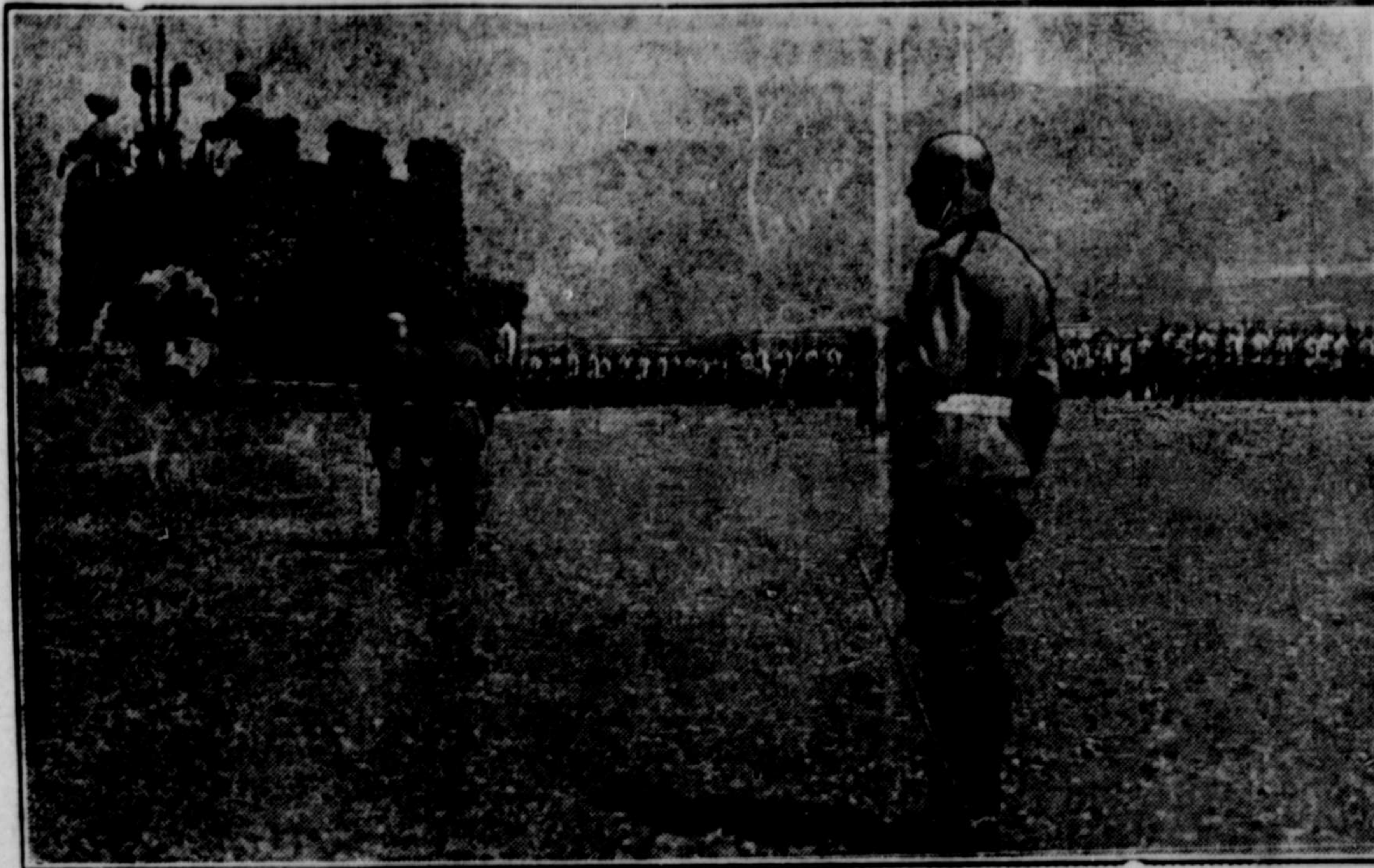
SERBIAN TROOPS BUILD A SANCTUARY IN HONOR OF KING PETER.—The troops of the re-organized Serbian army north of Saloniki recently erected a sanctuary with their own hands in honor of King Peter. The picture shows Mass being held before the troops go forth to battle.