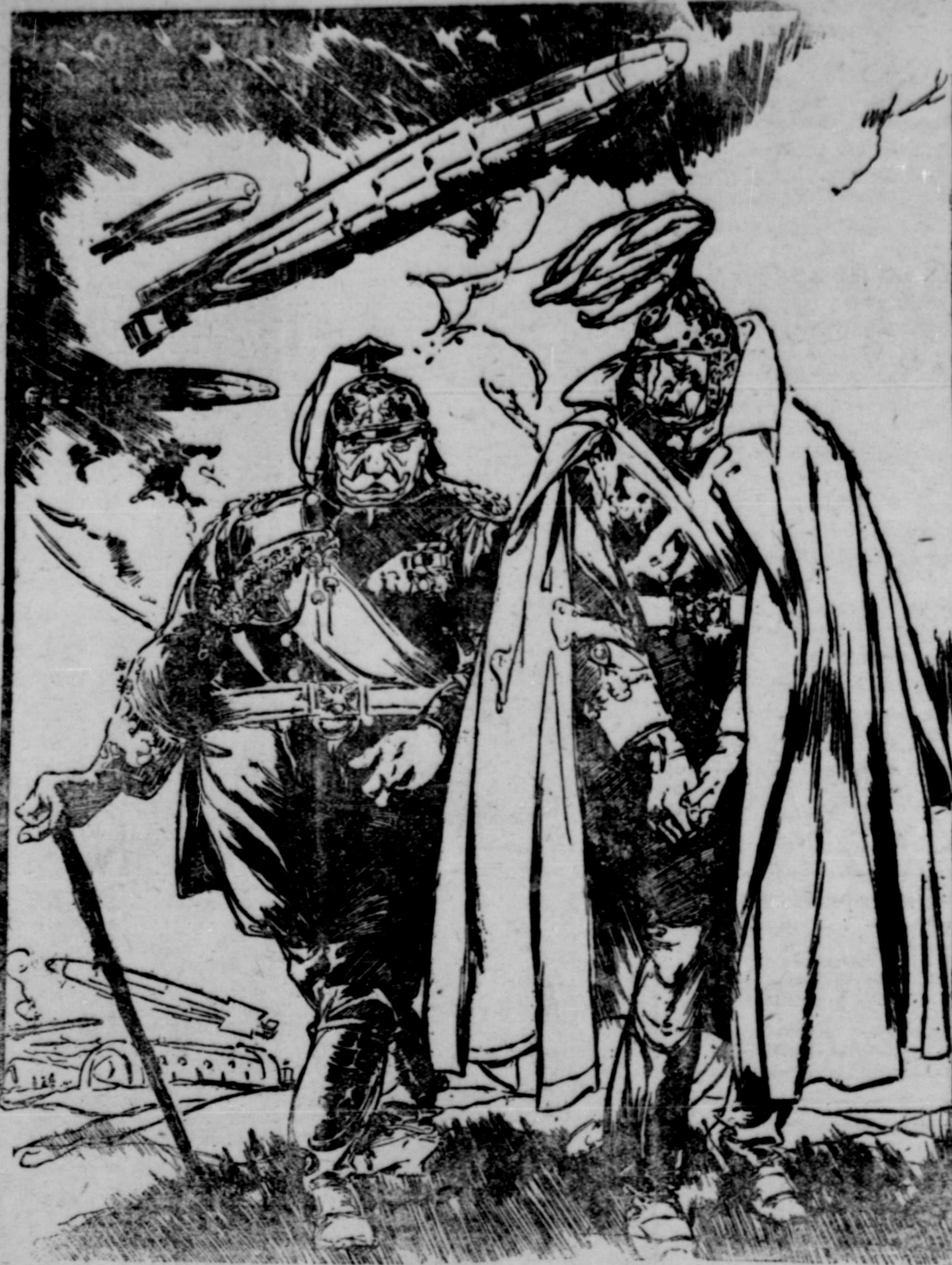
AIR RAIDS AND EXPECTATIONS. —Wilhelm to Count Zeppelin: "Ah, Zeppelin, we started air raids to break the spirit of the British and we have to continue them to keep up the spirit of the Germans."—London Chronicle.