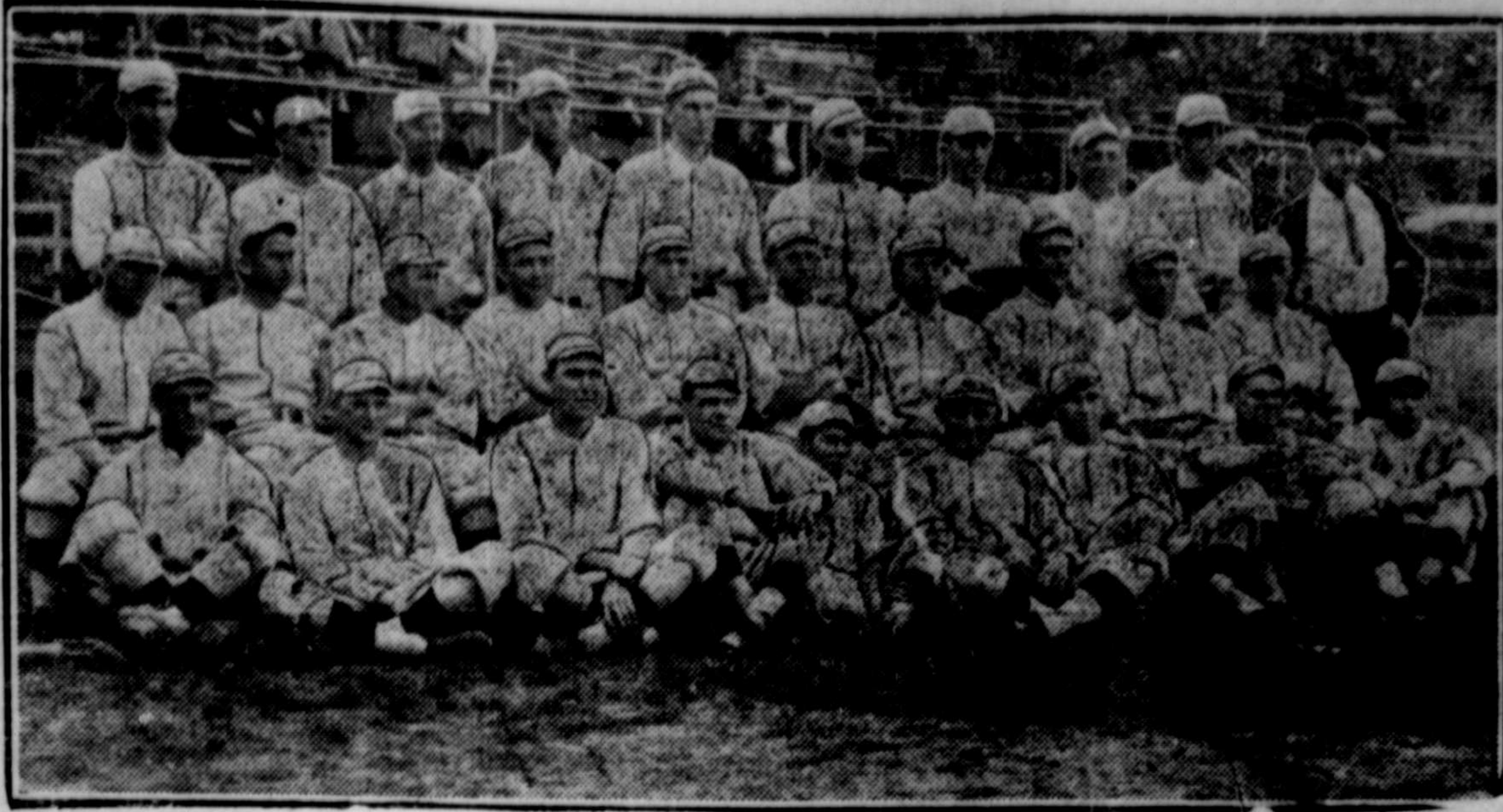
WORLD'S CHAMPIONS. —The Boston Red Sox, world's champions last year, who defeated Brooklyn in this year's series. Manager "Bill" Carrigan never had any doubt as to the ability of his boys to win the series and his confidence was justified by the results, the Red Sox taking three games out of four against the "Robins."