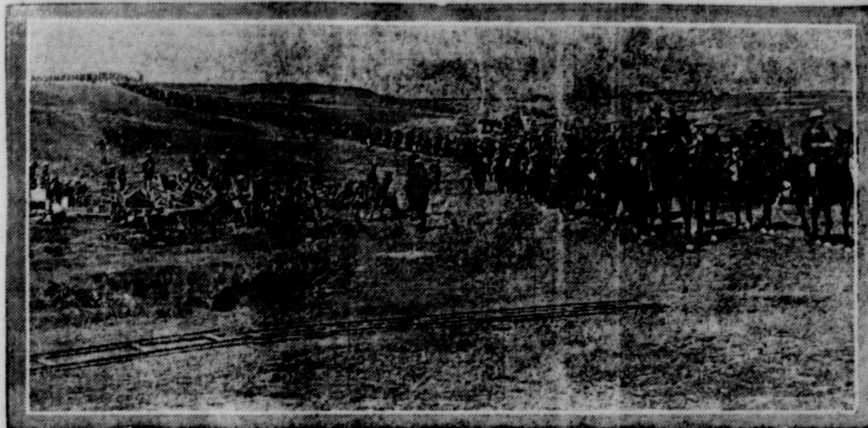
BRITISH CAVALRY ON THE SOMME FRONT.—A very unusual sight in this war of big guns and trenches is this column of British cavalry marching over captured territory on the western front, which might be imagined as belonging to an earlier war when hostilities were carried on in the open.

phone 416. We have just received a shipment of 500 tons Lump Coal. We are prepared to put in your winter's coal for you.