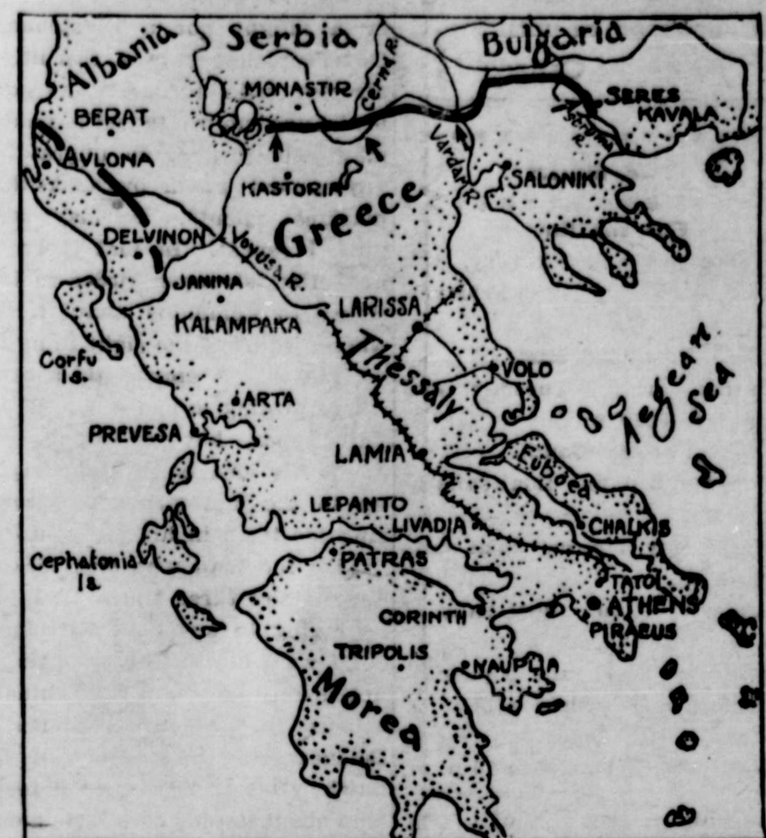
THE GREEK SITUATION

The Canadian Beet Sugar Company, Limited, has just been incorporated, with headquarters in Vancouver, with the object of growing sugar beets in the Bulkley Valley and in the Peace River district, and also of refining sugar. The company is modestly capitalized at $10,000.