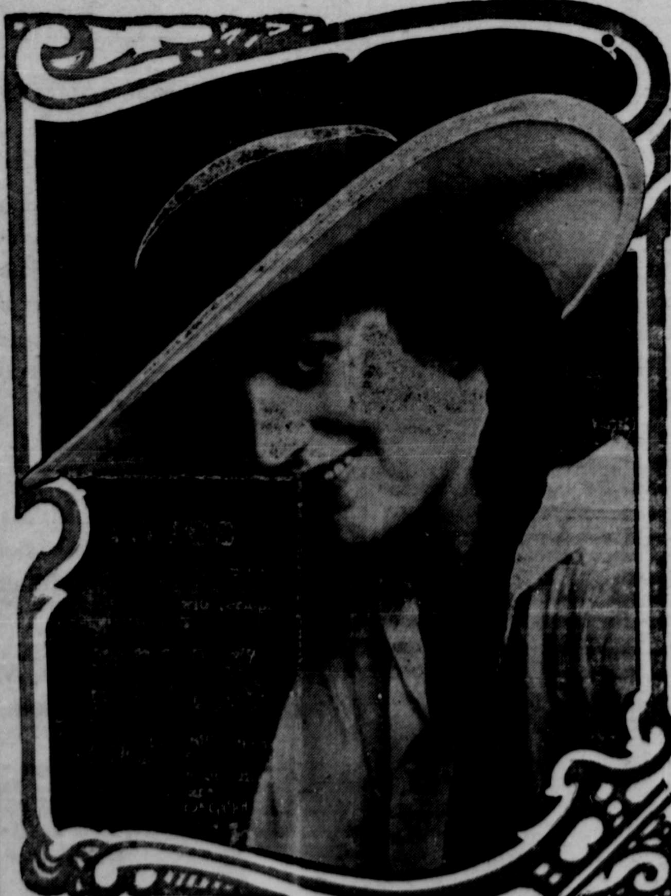
Helen Holmes in "The Girl and The Game" at Westholme tonight.