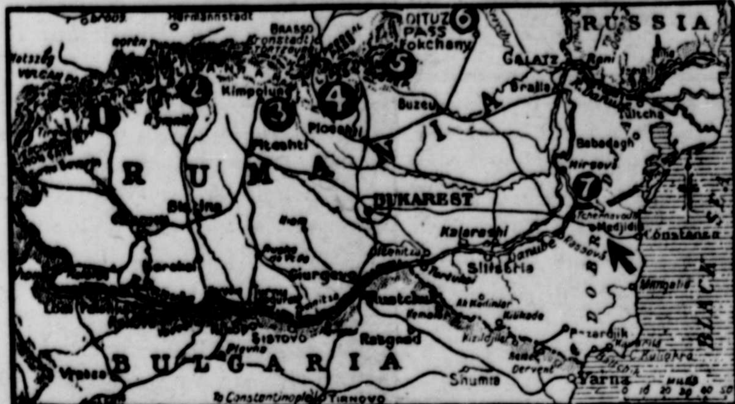
MAP ILLUSTRATING RUMANIA'S FLIGHT