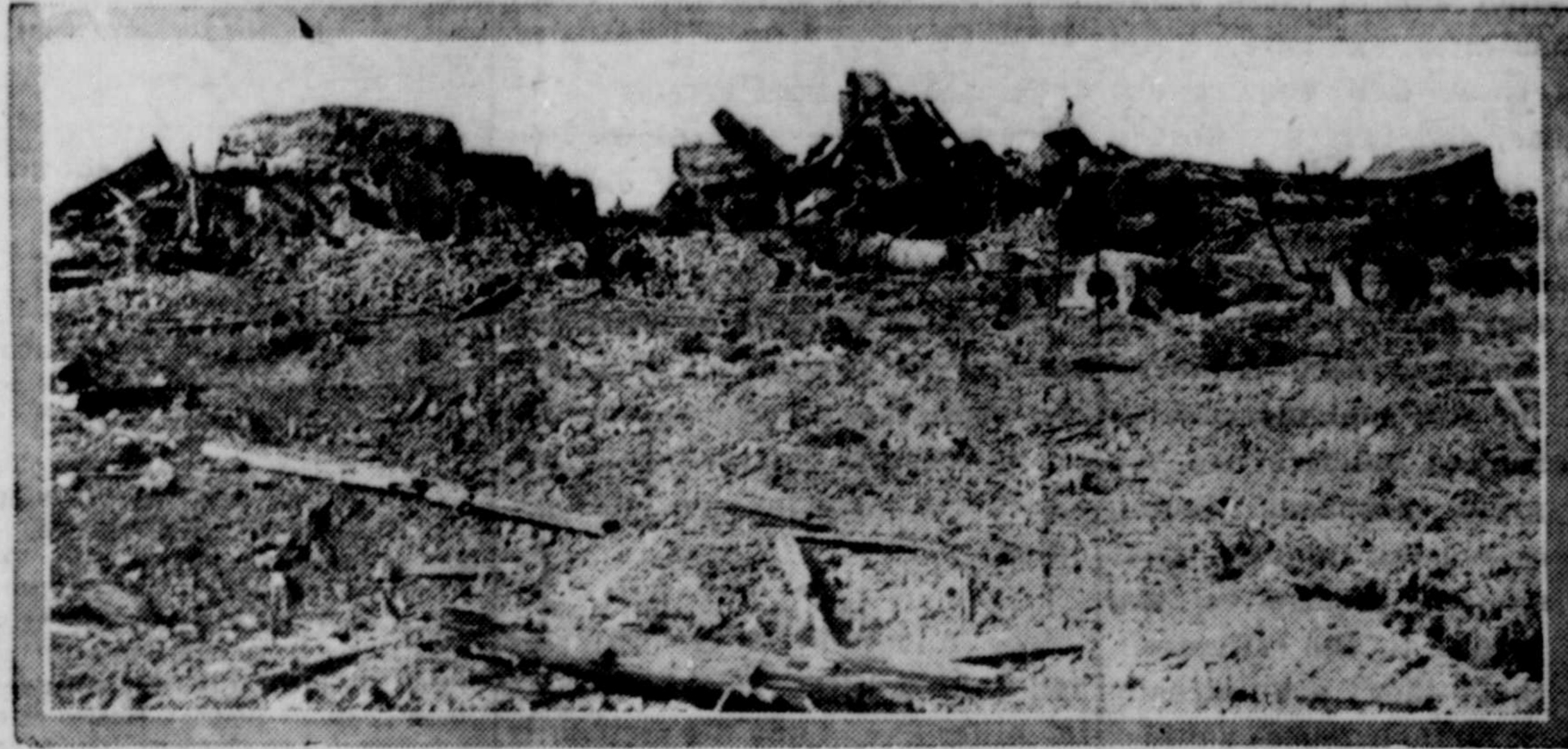
WHERE CANADA MADE THE BIG ADVANCE. —This is all that remains of the sugar refinery at Courcellette, which was among the places stormed by the Canadians in their big advance on the Somme front. Courcellette is in the northern section of the Somme, almost due east of Thiepval, where the British put in many days of desperate fighting.