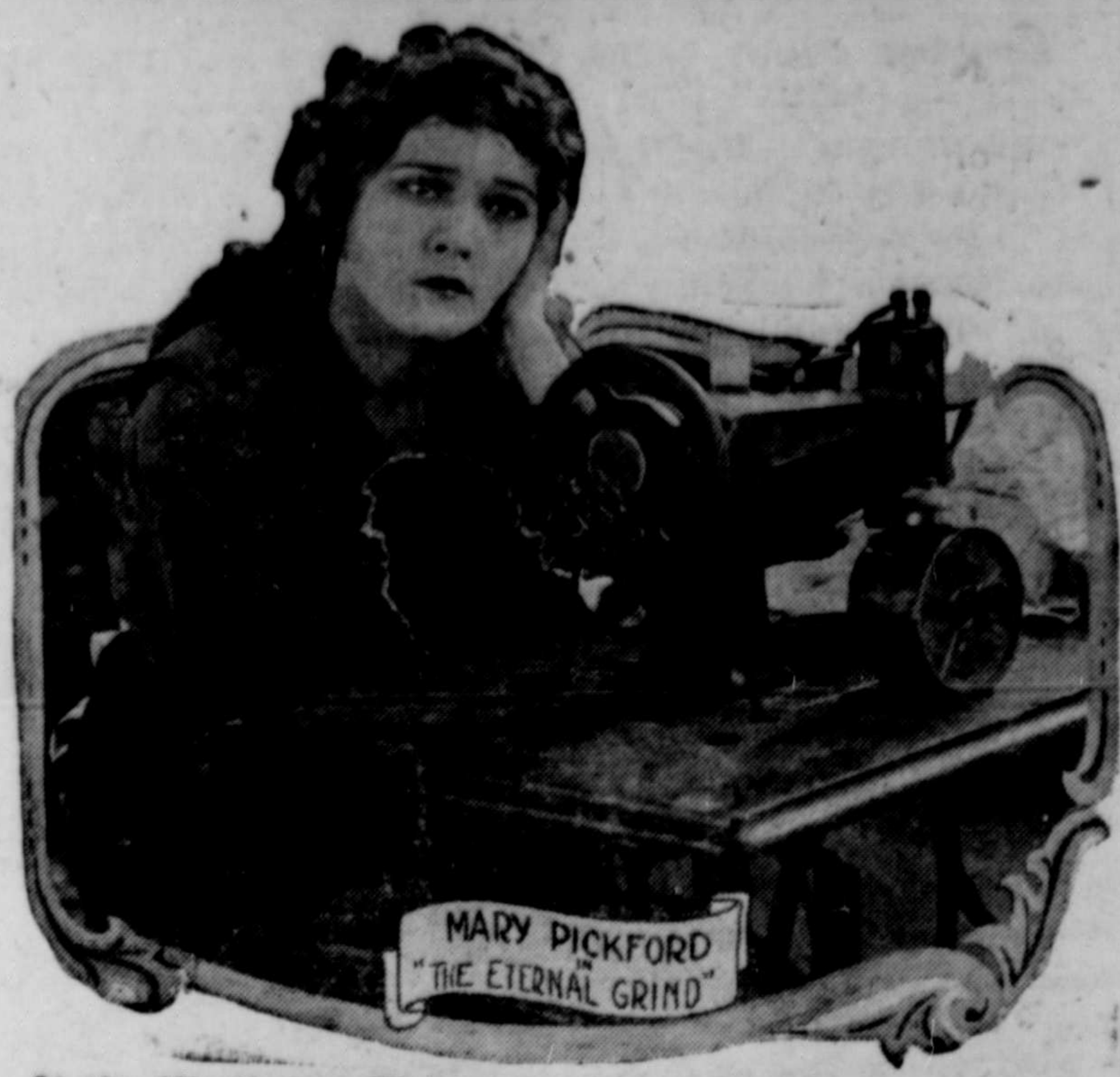
MARY PICKFORD "THE ETERNAL GRIND" At the Westholme Theatre to night only.

Many deputations have visited Ottawa to interview the government on the high cost of living and to see what it couldn't do about it. All these deputations got was a hearing and perhaps a soft nothing by way of an answer. It is not the intention of the Borden government to interfere with its friends making hay while the sun shines. Moreover the sun is going to shine for the Borden government's food-monopolizing friends as long as the Borden government remains in office. All the government's friends, shell makers, horse chanters, the Alli-