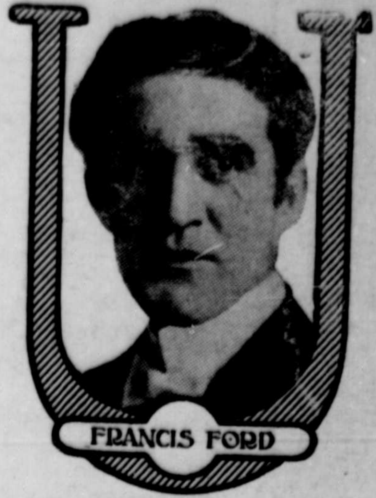
In "Peg O' The Ring" at the Westholme Theatre tonight.