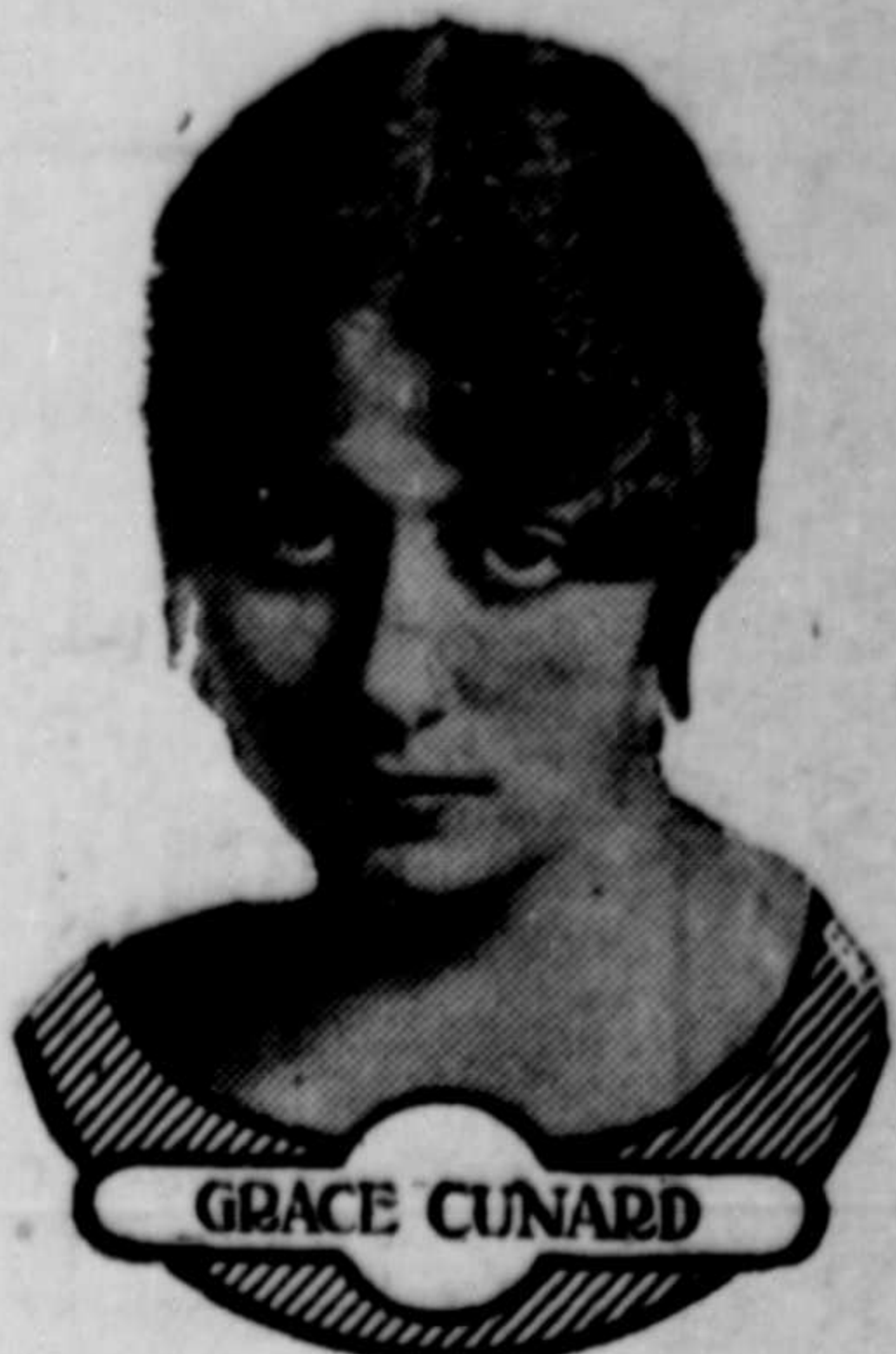
In "Peg O' The Ring" at the Westholme Theatre tonight.

A few days later, in the House of Commons, he made an impassioned speech from which the following is an extract: "Any step at this time by the United States, the Vatican or any other neutral in the direction of peace would be construed by Britain as an unneutral, pro-German move. Britain has only begun to fight, and we can brook no interference. The British soldier is a sportsman. He has fought as a sportsman and will die as a sportsman. He plays the game; has never squealed, and has never asked