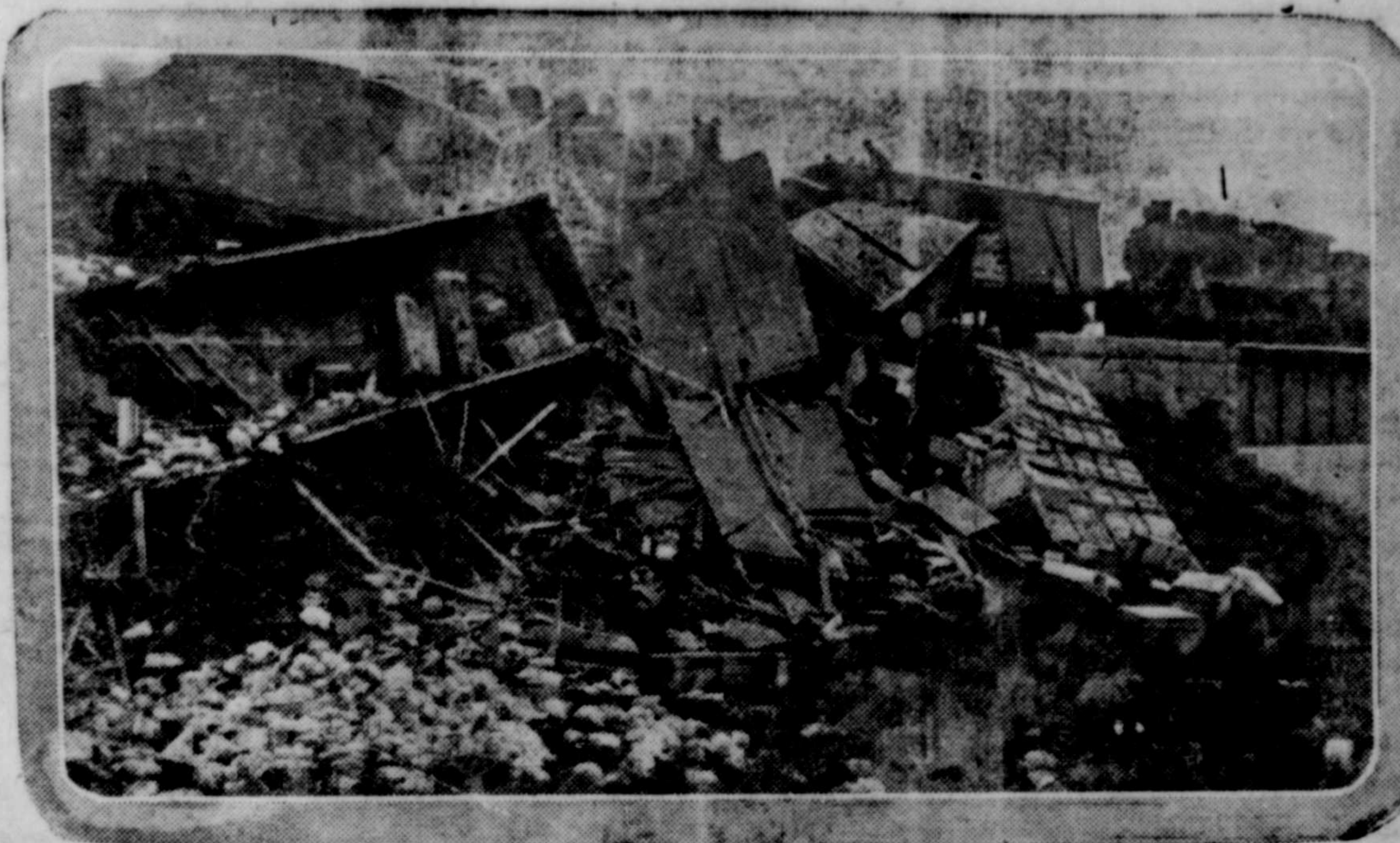
WRECK IN WHICH C. P. R. ENGINEER NARROWLY ESCAPED DEATH

Toronto, Nov. 16.—One hundred thousand dollars damage has been done by fire to the warehouses of Adams Brothers, leather merchants in this city.