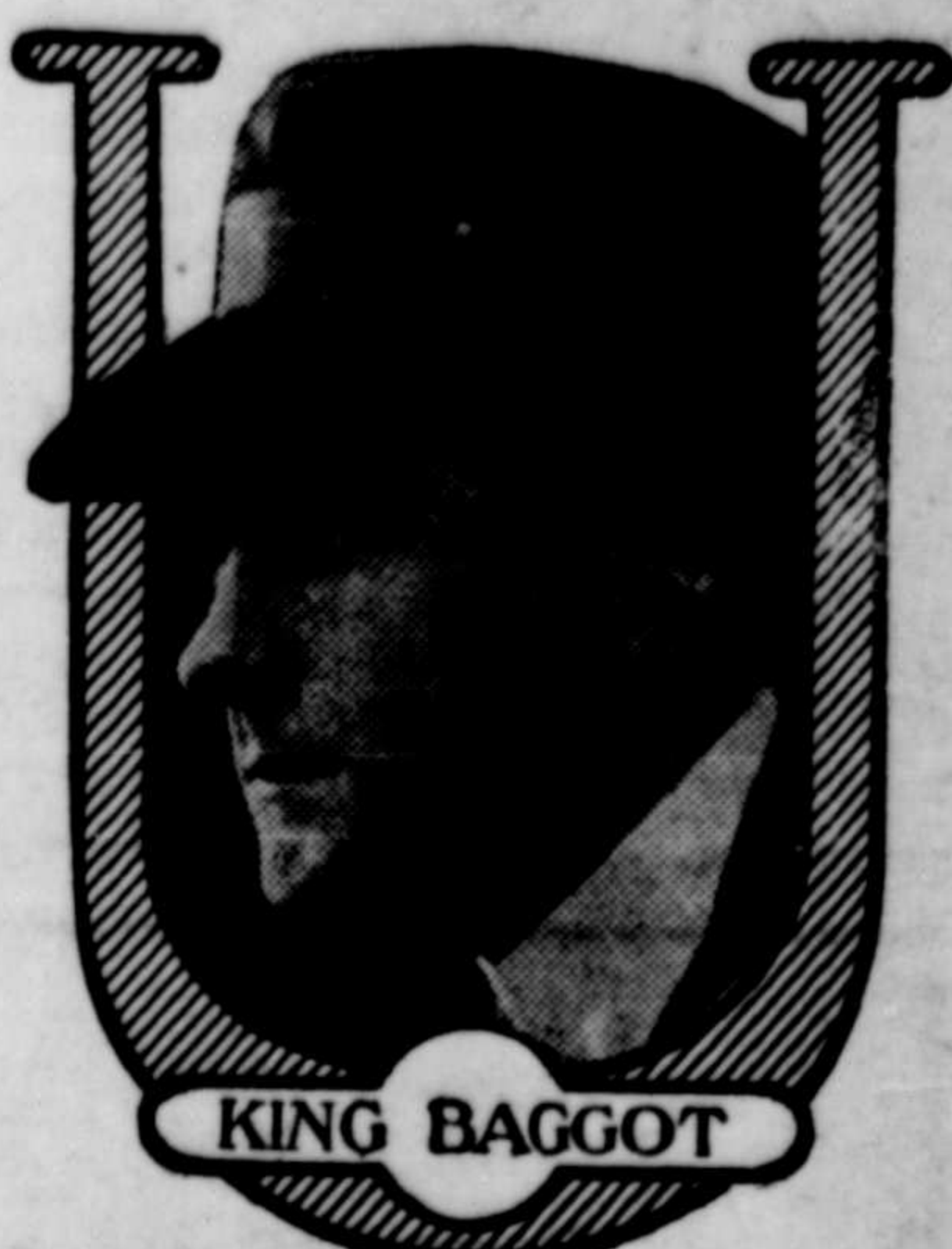
In "Half A Rogue" at the Westholme Theatre tonight.

anyone to squeal for him. We are fighting for fair play against a bully and we shall fight until we get it. Any talk of France or Russia making a separate peace is nonsense. I have just visited the battlefields of France. I stood, as it were, at the door of hell and saw myriads marching into the furnace. I saw some come out of it scorched and mutilated. This ghastliness must never again be re-enacted on this earth, and one method at least of ensuring that end is the infliction of such punishment upon the perpetrators of this outrage against humanity that the temptation to emulate their exploits will never again enter the hearts of the evil-minded amongst the rulers of men. That is the meaning of Britain's resolve."