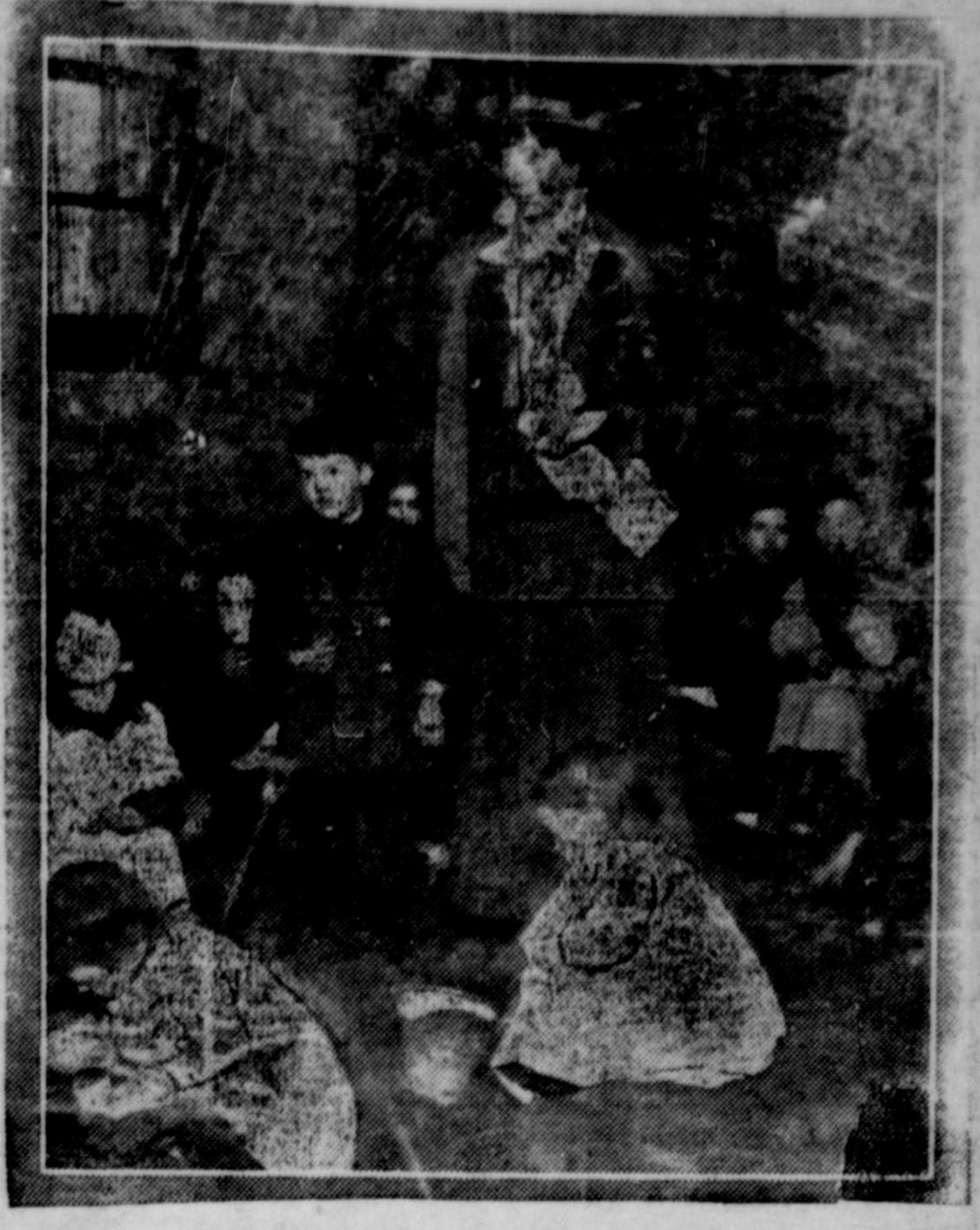
WHERE THE SOLDIERS' KIDDIES PLAY IN PEACE.

Salvation Army. Public meetings, Tuesday Thursday and Saturday at 8 p. m. Sundays at 7:30 p. m. The Daily News delivered by carrier, 50 cents per month.