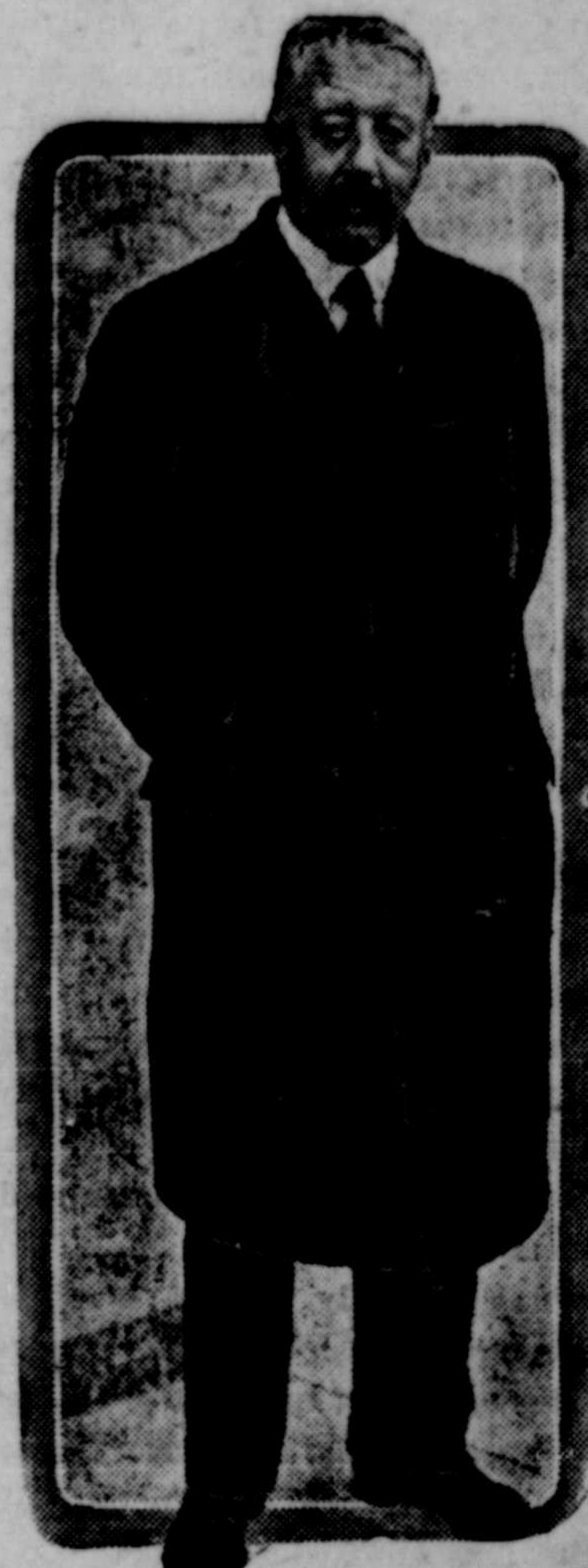
THE DUKE OF DEVONSHIRE